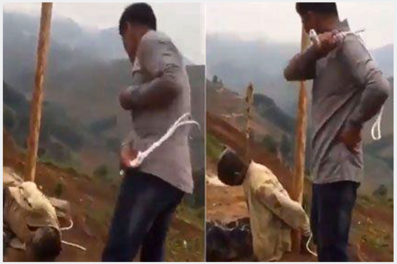
Figure 4. Labor abuse in Rwanda

Rwandan human rights organizations and media outlets have highlighted PRC mining entity abuses against African workers. The reported instances of abuse include a manager of a PRC-owned mine whipping multiple African mine workers.