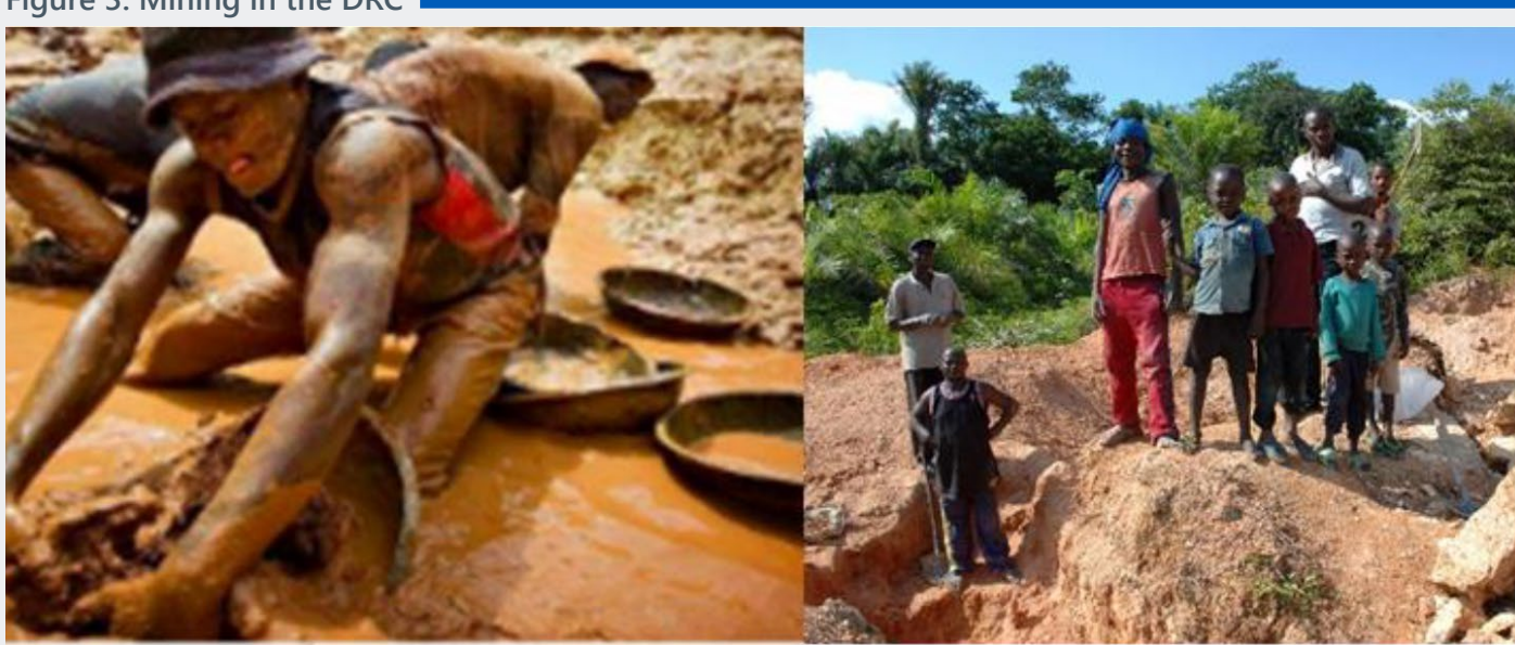
Figure 3. Mining in the DRC

DRC activist and human rights organizations allege that PRC companies benefit from entrenched child labor in the minerals' supply chain, support supply chains with dangerous working conditions, and fail to carry out due diligence in accordance with accepted mining guidelines and regulations.