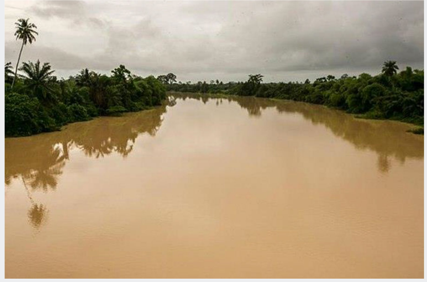
Figure 7. Polluted waters of Ghanian river due to mining activities

Reports from across Ghana show Chinese national-owned mining entities illegally mining gold in Ghana, causing severe environmental effects and health hazards through unsafe mining activities.