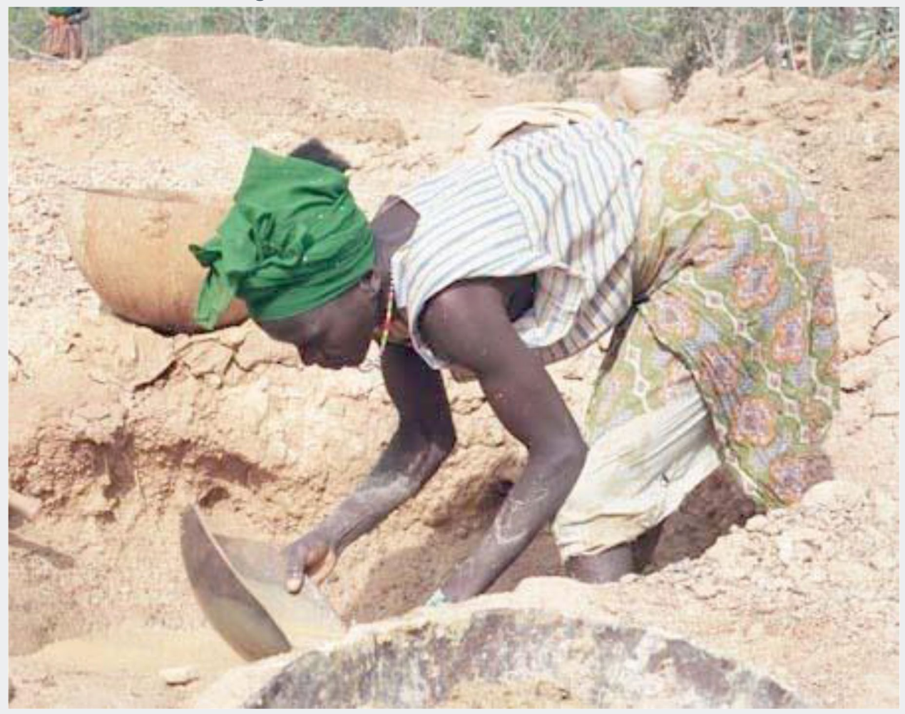
Figure 6. Guinean worker mining bauxite