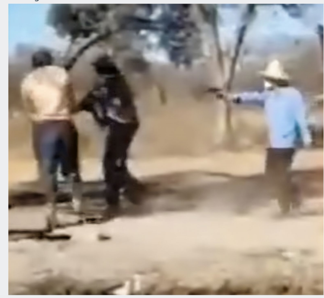
Figure 5. Violence against mine workers

Zimbabwean mine unions allege that PRC mining entities abuse African workers. Reports from Zimbabwean media detail abuses, including an incident in which a Chinese mine employer shot two local mine workers at point-blank range over a wage dispute.