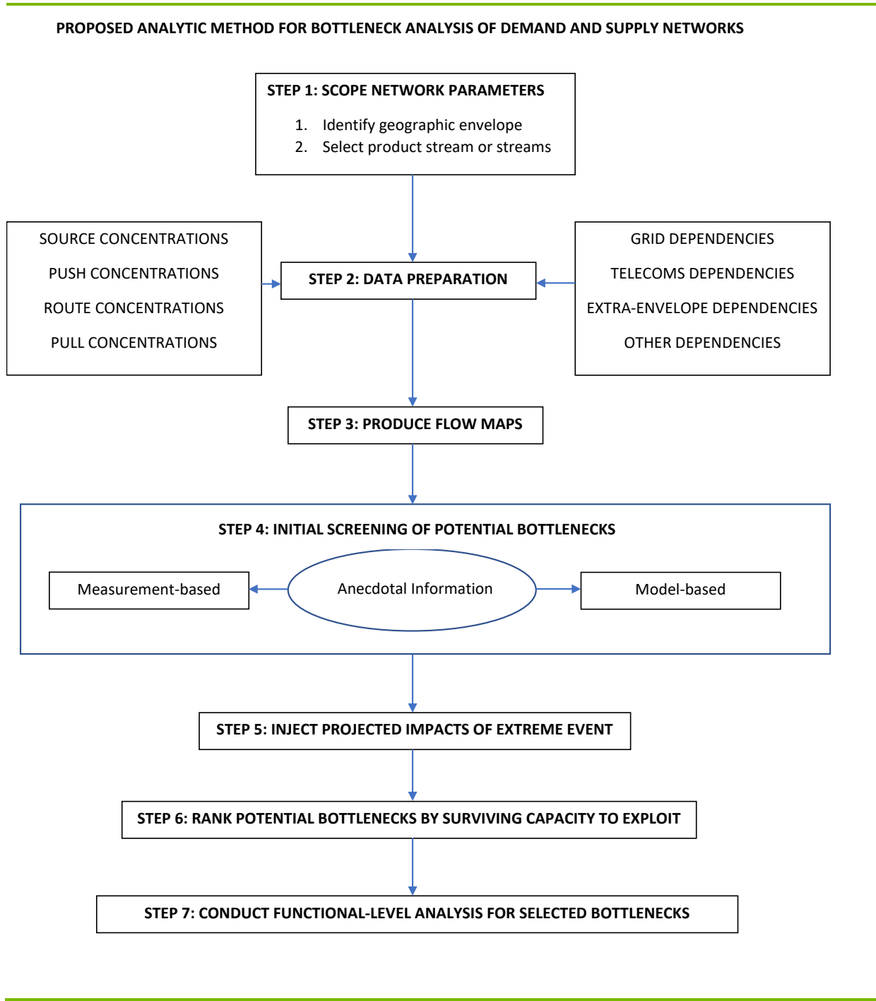
Figure 2. Adapting the bottleneck analysis method specified in The Freight Performance Measure Approaches for Bottlenecks, Arterials, and Linking Volumes to Congestion Report (reproduced from a March 2019 planning document)