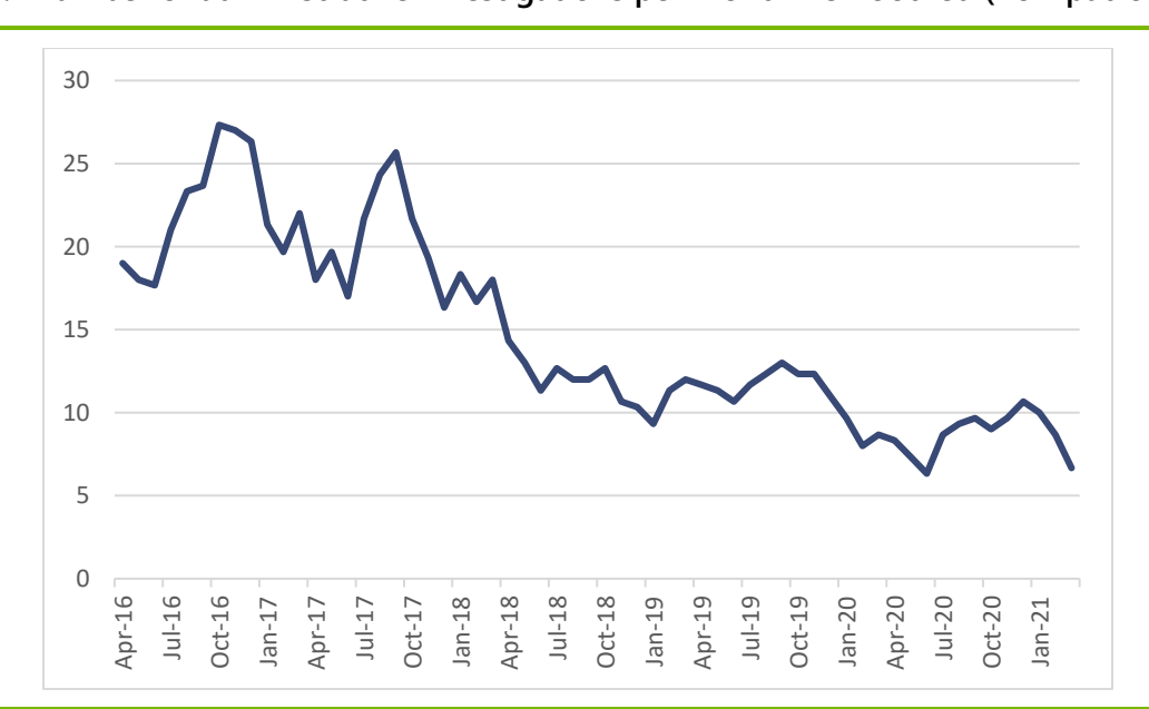
Figure 2. Number of administrative investigations per month – smoothed (non-patrol)

Although on the surface this may appear to be a positive trend, a deeper examination of the data indicates that the broader decrease is attributable to decreases in administrative investigations of non-patrol sworn members. For this population, the smoothed data indicate the largest peak in late-2016 (approximately 27 administrative investigations per month), which has decreased to a current level of approximately six administrative investigations per month (Figure 2 below).