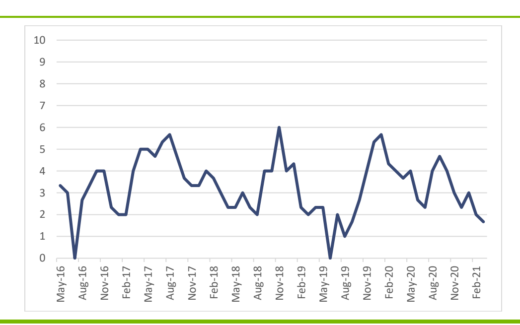
Figure 4. Number of administrative investigations per month – smoothed (civilian)