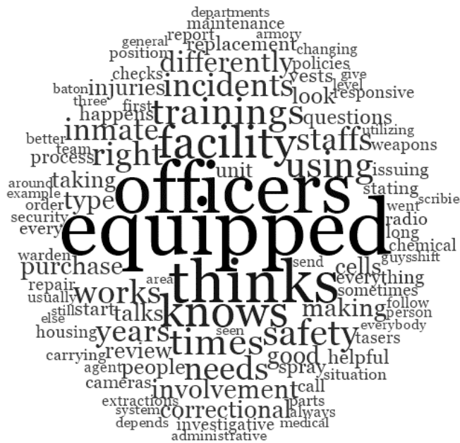
Figure 1. Word cloud from interview transcripts

During the study, our team conducted 61 interviews across seven facilities. Interviews lasted from 15 minutes to over an hour, with most lasting approximately 30 minutes. This section presents findings from coded thematic analysis of the interview transcripts, with additional insights from notes from the non-transcribed interviews.