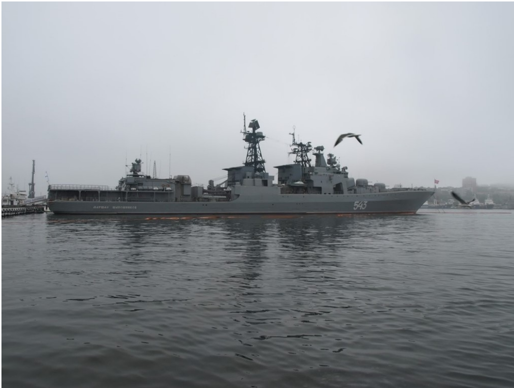
Figure 3. BPK "Marshal Shaposhnikov, an active participant in anti-piracy operations

Only in the second half of the 2000s, when a long-term counterpiracy operation was deployed near the Horn of Africa, was Russia forced to turn its attention once more toward expeditionary forces. In the absence of nearby logistics centers, the navy used ships that were not the most appropriate for such tasks—for the most part, antisubmarine destroyers and frigates. A large part of the campaign in the Horn of Africa area was carried out by the ships from the Pacific, Northern, and Baltic Fleets. As the Black Sea Fleet had an insufficient number of modern surface warships, it participated in the operation in only a limited capacity.