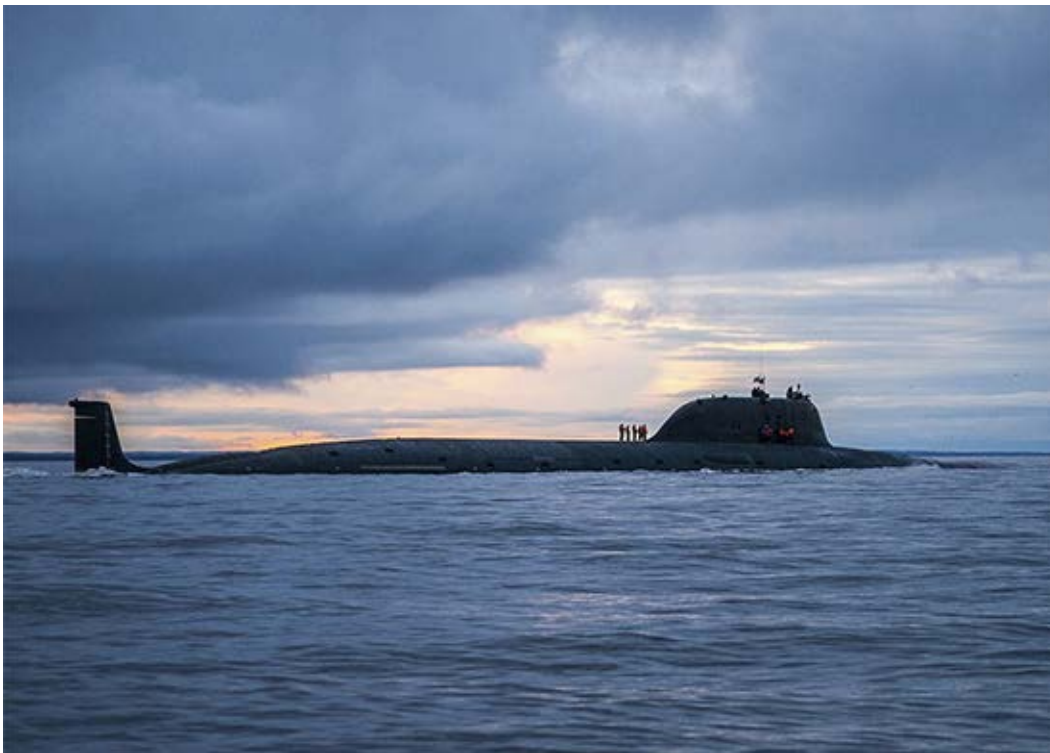
Figure 4. Project 885M SSGN K-561 "Kazan" during its first foray on sea trials

have no more than 10 Soviet-era nuclear-powered SSNs. What's more, six new Yasen-M class SSN/SSGNs will be built from 2018 through 2022. They were ordered under the auspices of GPV-2020 and will join the class leader Yasen-class submarine K-560 Severodvinsk , which was commissioned in 2013. One way or another, the number of nuclear-powered multipurpose attack submarines in the lineup—not even talking about the number of submarines technically fit to carry out missions—is considered entirely insufficient.