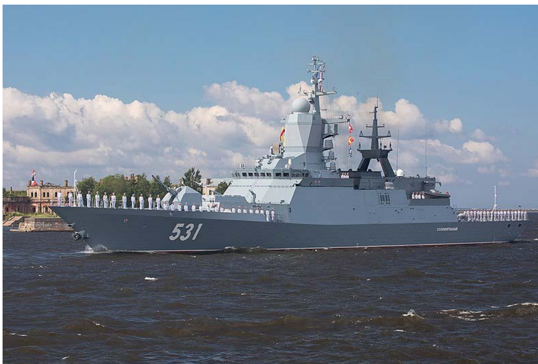
Figure 2. Project 20380 “Soobrazitelny” Corvette in the English Channel, April 2017

It is well known that GPV-2020 envisioned the building of six Admiral Gorshkov class frigates (Project 22350) and 16 Gremyashchiy-class corvettes (Project 20385) in addition to two Admiral Gorshkov class frigates and four Steregushchiy-class corvettes (Project 20380), which were promised to be completed before 2011. 29 Later, these plans were amended due to the halt in diesel engine supplies from Germany. Thus, in the Severnaya Verf (“Northern Shipyard”) only two Gremyashchiy-class corvettes were laid down and the construction of two other Steregushchiy-class series hulls was resumed, while only Steregushchiy-class corvettes were built at the Amur Shipbuilding Plant.