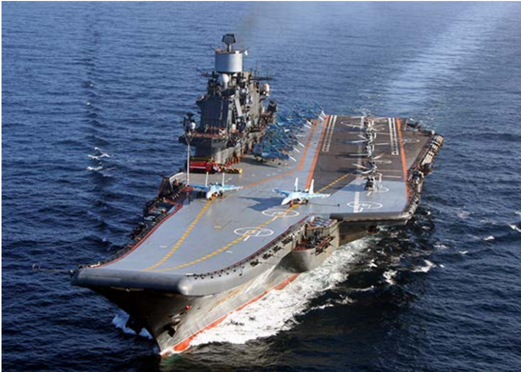
Figure 1. Admiral Kuznetsov