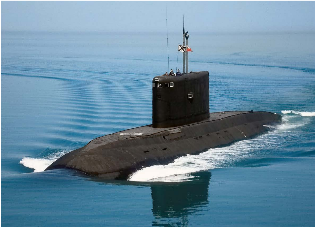
Figure 5. SSK B-237 “Rostov-on-Don”