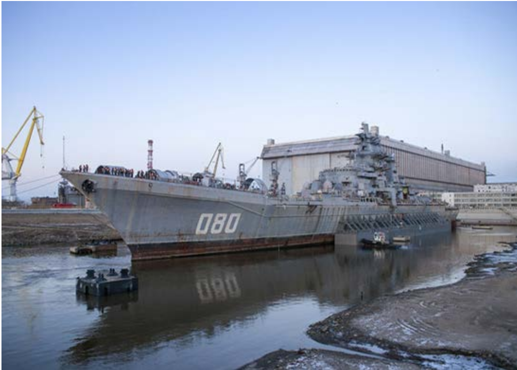
Figure 6. TARKR "Admiral Nakhimov" under repair