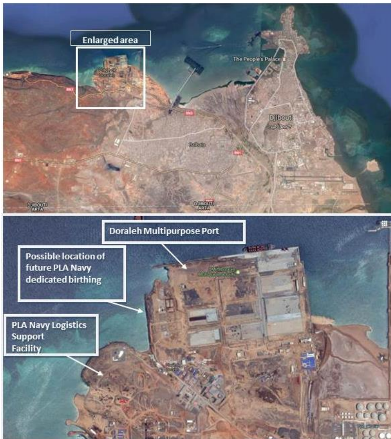
Figure 3. China's naval facility in Djibouti

Most of China's military logistics facilities in Djibouti are being built immediately southwest of the Doraleh Multipurpose Port (see Figure 3), although the PLA Navy will have one of the port berths dedicated exclusively for its use. It is expected to be completed in 2017, though the Chinese government has not officially provided any figures on the number of personnel that will be stationed there. The base is also unofficially reported to include storage for fuel, weapons, and equipment, and maintenance facilities for helicopters and for commercial and military ships. 98