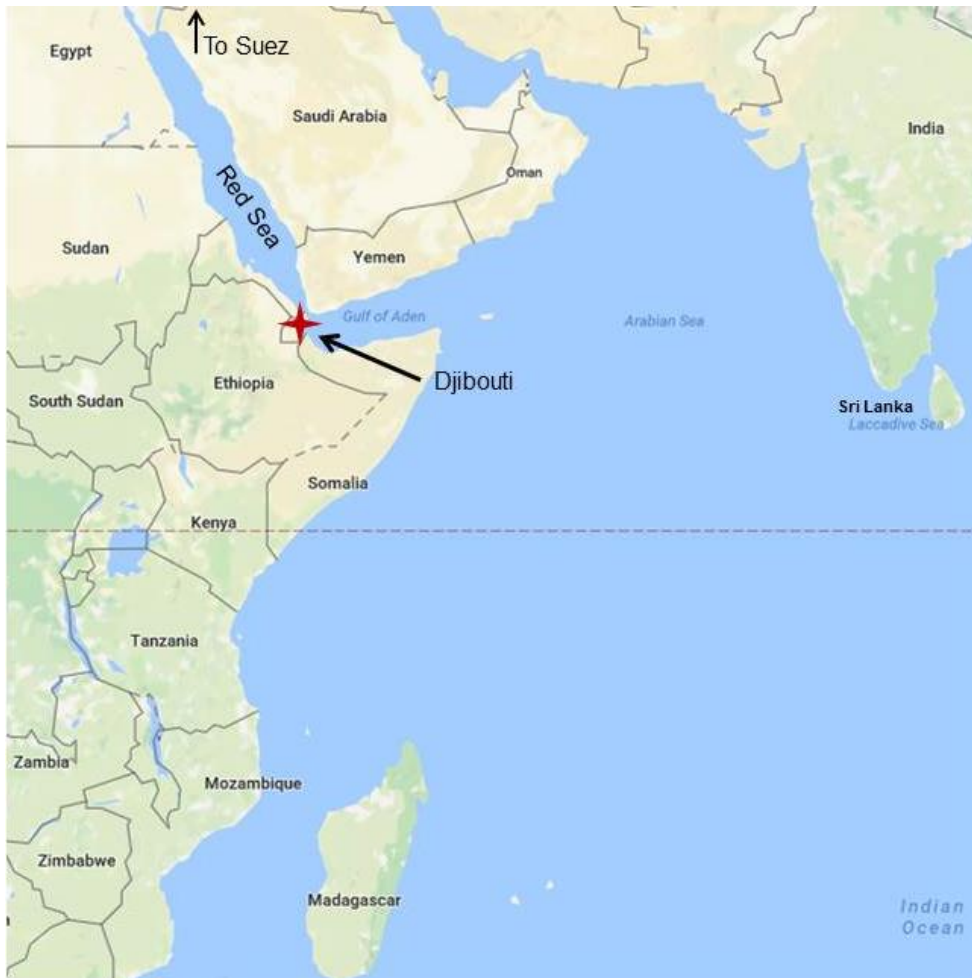
Figure 1. Djibouti's strategic location

investments in a variety of infrastructure projects, including port and transportation facilities, power generation and distribution, and water supply. 9 These projects are largely financed by foreign entities. 10