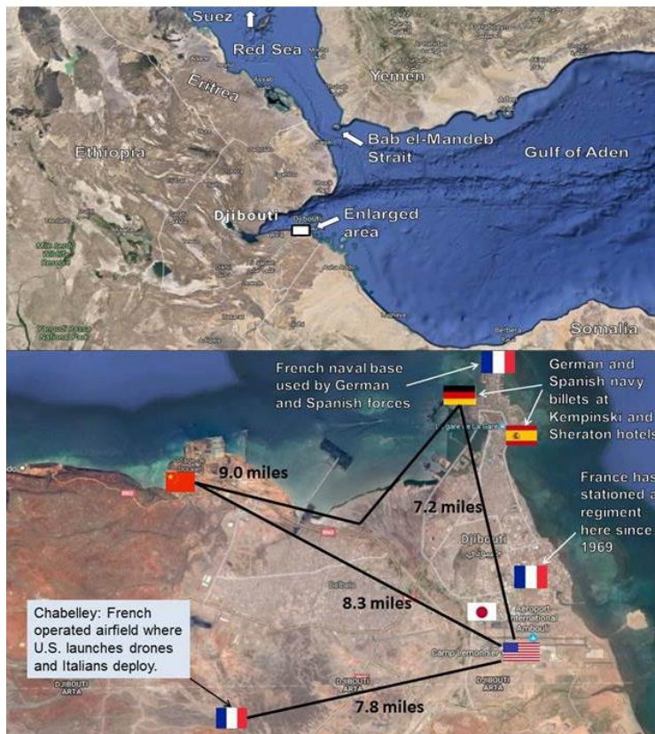
Figure 4. Foreign military facilities in Djibouti

See Appendix B for sources used to determine base locations.