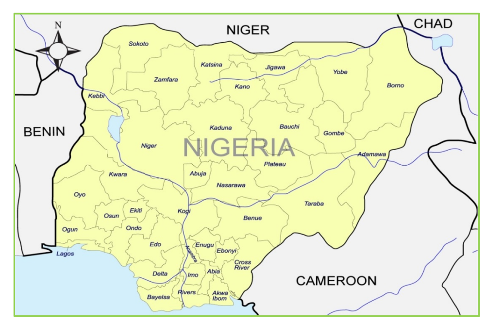
Figure 1. Nigeria's administrative divisions

The United States has long viewed Nigeria (see Figure 1) as a strategically important country and has been engaging with its government both diplomatically and militarily for years. Nigeria is Africa's largest economy, its largest producer of oil, and its most populous country. Its government is a leading actor in regional politics, an important contributor to peacekeeping operations in Africa, and as of this writing, the country holds a rotating seat on the United Nations (UN) Security Council.