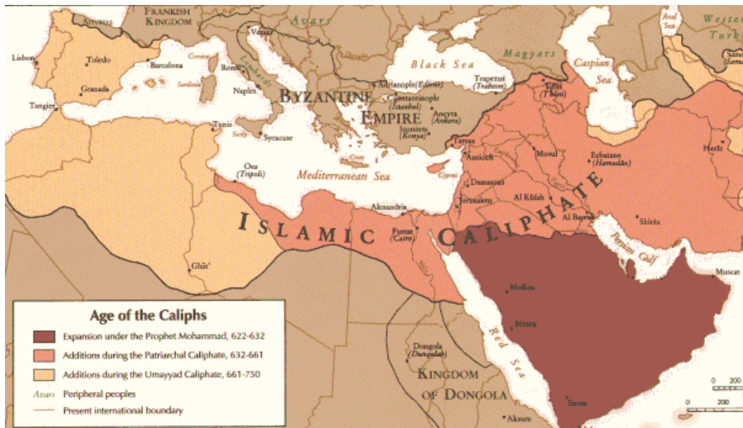
Figure 1. Age of the Caliphate, 632–750 A.D.