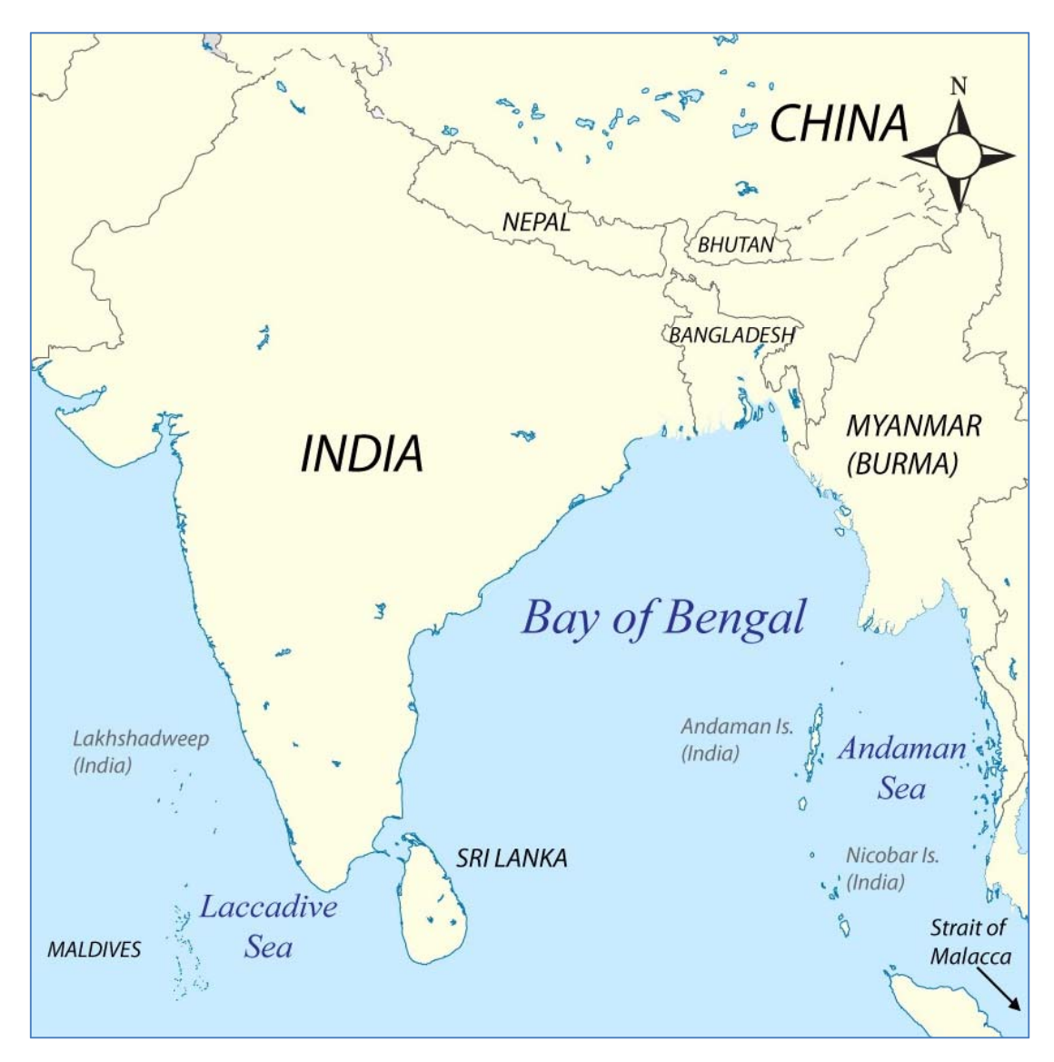
Cleared for Public Release IRP-2012-U-002319-Final September 2012