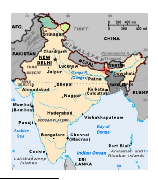
Figure 4: Siliguri Corridor

If the project in Sittwe is a consolation prize, it is a good one for India's domestic needs. The Kaladan project represents an alternative to the time-consuming, land-based transit route, known as Siliguri Corridor or Chicken's Neck, which connects India's "Seven Sisters" to the rest of the country. (See the red highlighted circle between Nepal, Bhutan, and Bangladesh in figure 4.)<sup>41</sup> The corridor is known for its "hilly terrain with steep roads and multiple hairpin bends that make transporting goods very difficult."<sup>42</sup> Through the Kaladan project in Burma, expanded connectivity between mainland India and its northeast will help increase economic development of this often neglected region and perhaps reduce insurgency in the long term.