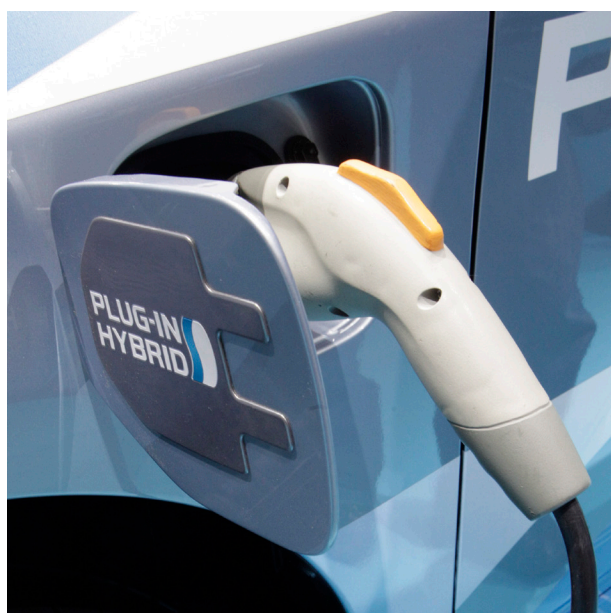
Toyota Plug-in Hybrid

ernment supports research and development in these technologies and offers considerable subsidies for purchases by consumers. The Obama administration aims to put one million electric or hybrid vehicles on the road by 2015.