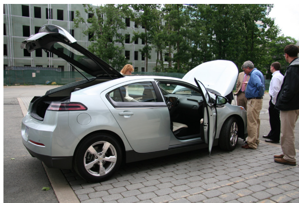
Members of the CNA Military Advisory Board inspect an electric car.

Hydrogen as a fuel can be used by modified internal combustion engines or as fuel cells which power engines electrically. There are various ways of produc-