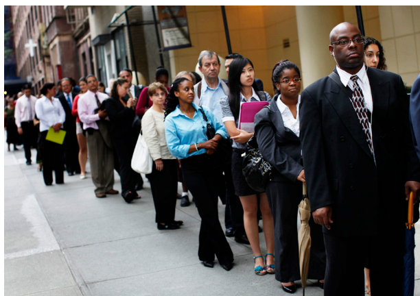
An unemployment line in New York City.

These calculations suggest we have a great deal to gain from reduced oil use. But they also indicate that the U.S. does not need to fully wean itself from oil to gain these benefits. A 30 percent reduction of oil use, if achieved, would dramatically improve national security. In fact, even a smaller reduction, of 15-20 percent, would lessen dramatically the impact of an oil supply shock to the U.S. economy and to household incomes. (This does not mean we must reduce domestic production; we can achieve these gains by importing less from adversarial nations.)