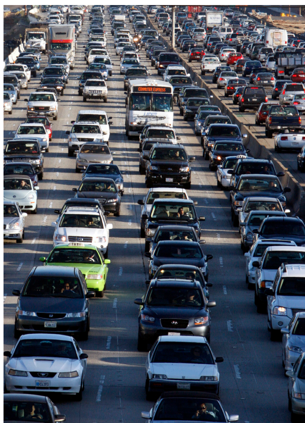
Vehicles are seen during rush hour on the 405 freeway in Los Angeles.

Those of us expressing concern about America's diplomatic hands being tied, in part by our need to retain access to global oil supplies, ended up seeing that this would stop only when we changed our approach to energy.