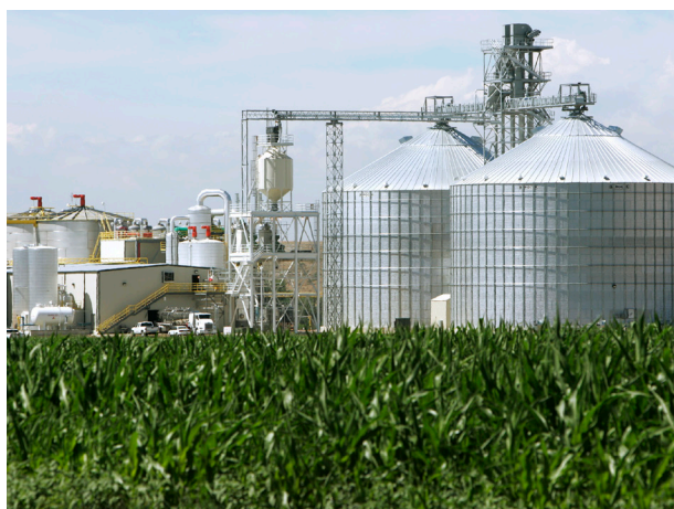
Front Range Energy ethanol plant Windsor, Colorado.

The technologies for producing basic biofuels and for using them in conventional engines are well proven, though the production of advanced biofuels from algal oil poses challenges at commercial scale. The delivery, storage, and use of biofuels in traditional pipes, valves, and tanks are somewhat complicated by the corrosiveness of the materials. Also, their use in higher concentrations in traditional vehicles requires engine modifications.