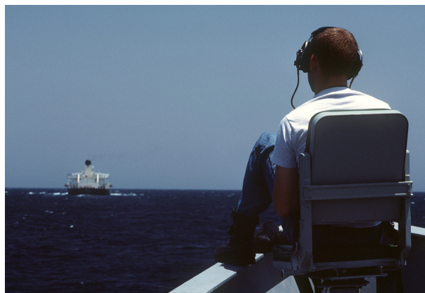
USS NICHOLAS (FFG-47) escorts the tanker SS CHESAPEAKE CITY through the Persian Gulf

Looking ahead, the leading oil producing countries will likely include Venezuela, Russia, Nigeria, and Kazakhstan, and the volatile, oil-rich Middle East, including Iran, and Iraq. The United States could partially address our vulnerability to the whims of these suppliers by sourcing more of our oil from friendly, stable nations, such as Canada and Mexico, or by increasing domestic production. However, even in these cases, oil shocks—deliberate or otherwise—would still affect U.S. consumers. If global prices rise, the price of oil produced domestically and oil bought from friendly countries will also rise. Oil is sold on a global market; prices here at home are affected by