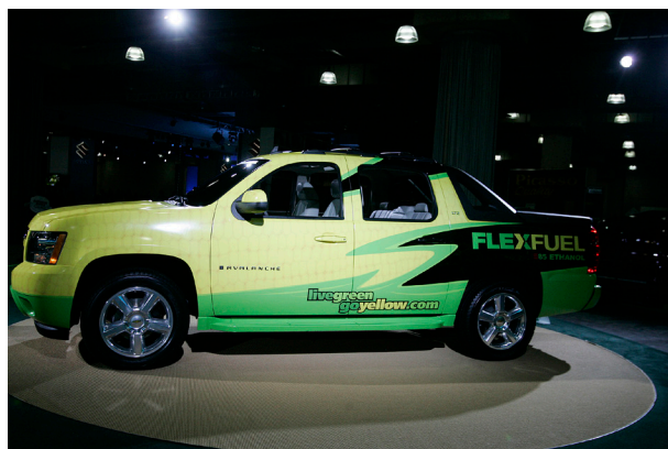
The Chevy Avalanche flexible fuel vehicle (FFV).

The ideal replacement for 30 percent of our country’s oil is not one particular type of new fuel. Instead, it is a set of several new fuels, technologies, vehicle types, and driver practices. This is true at least in the short-term; over time, market-driven innovations will alter the affordability of various options. Coordination is essential—diversity cannot interfere with interstate mobility.