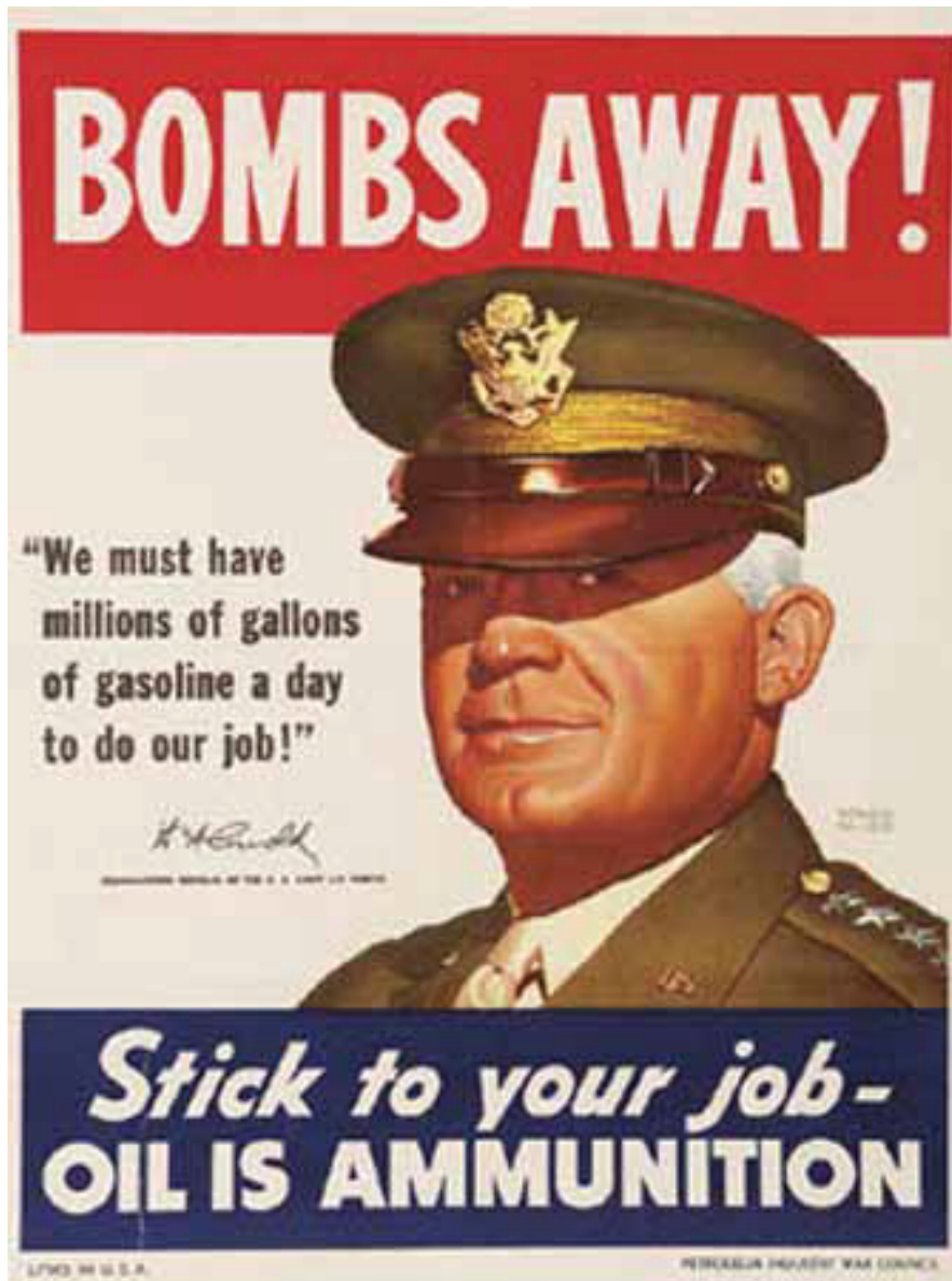
Shown above and on the inside front cover: Two war efforts posters seen during World War II showing how little has changed.