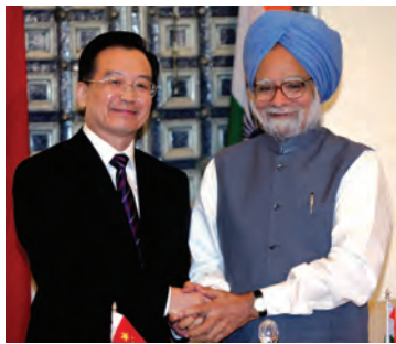
Chinese Premier Wen Jiabao (L) shakes hands with Indian Prime Minister Manmohan Singh after the two countries signed agreements in New Delhi April 11, 2005.