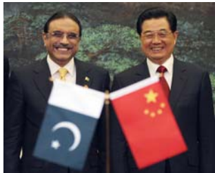
Cover Photo: Chinese President Hu Jintao and Pakistani President Asif Ali Zardari in front of their countries' flags during a signing ceremony in Beijing October 15, 2008.