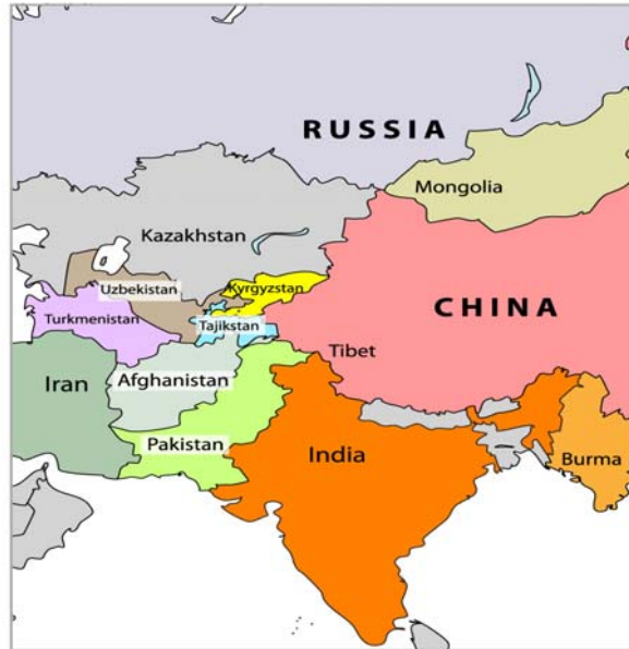
Figure 1. China – Pakistan in the Region

By the same token, China is seen to be especially close mouthed about the relationship. One participant pointed out that China rarely goes public with any criticism of Pakistan, instead favoring private channels to communicate its interests and concerns. By contrast, Pakistan more frequently offers public praise for the importance of its relations with China and of PRC activities in Pakistan.