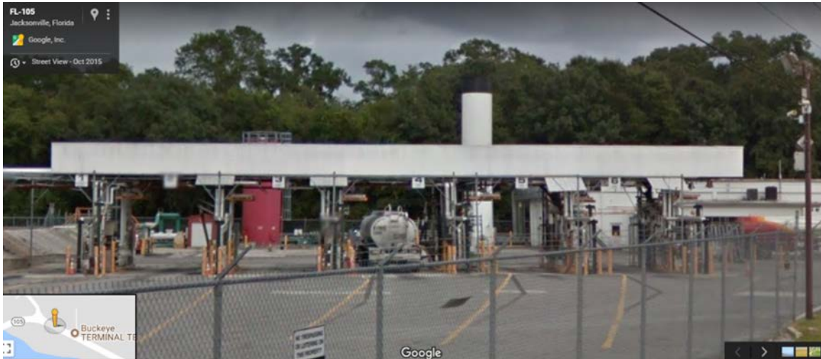
Figure CS5-2. Buckeye Terminals, LLC - Jacksonville 2617 Heckscher Drive