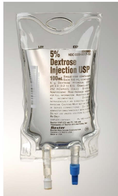
Figure CS5-6. Baxter IV bag

Since 2015—and Hurricane Maria—Trailer Bridge experienced specific increases in shipping volumes for intravenous bags. Baxter is the largest US producer of these products. There are two plants in Puerto Rico that produce over 40 percent of the intravenous bags used in US healthcare. [39] A global shortage of these products began in 2014. Since then Baxter has been pushing to fill the gap, hence the increase seen by Trailer Bridge. In this case, the production capacity constrains more than the transportation capacity.