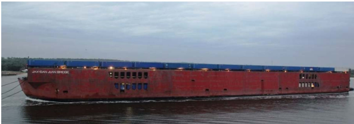
Figure CS5-4. The JAX-San Juan Bridge is a non-propelled barge, 223 meters x 32 meters

Demonstrating this delay—and the maritime system’s adaptability—one of Trailer Bridge’s vessels ( Chicago Bridge ) departed Jacksonville on September 1 arcing south of Cuba to avoid Irma’s storm track. The vessel arrived at San Juan on September 12. The JAX-San Juan Bridge arrived at Jacksonville on September 5 and was held there until late on September 12. Memphis Bridge arrived from San Juan on September 7 and did not depart until September 15. Both vessels took the long way around Hispaniola to avoid Maria, arriving at San Juan on September 23. In early September, Trailer Bridge reactivated the vessel Brooklyn Bridge in anticipation of needing additional capacity to make up for these delays. [27] The vessel JAX-San Juan Bridge (see Figure CS5-4 below) was also sailing proximate sea lanes.