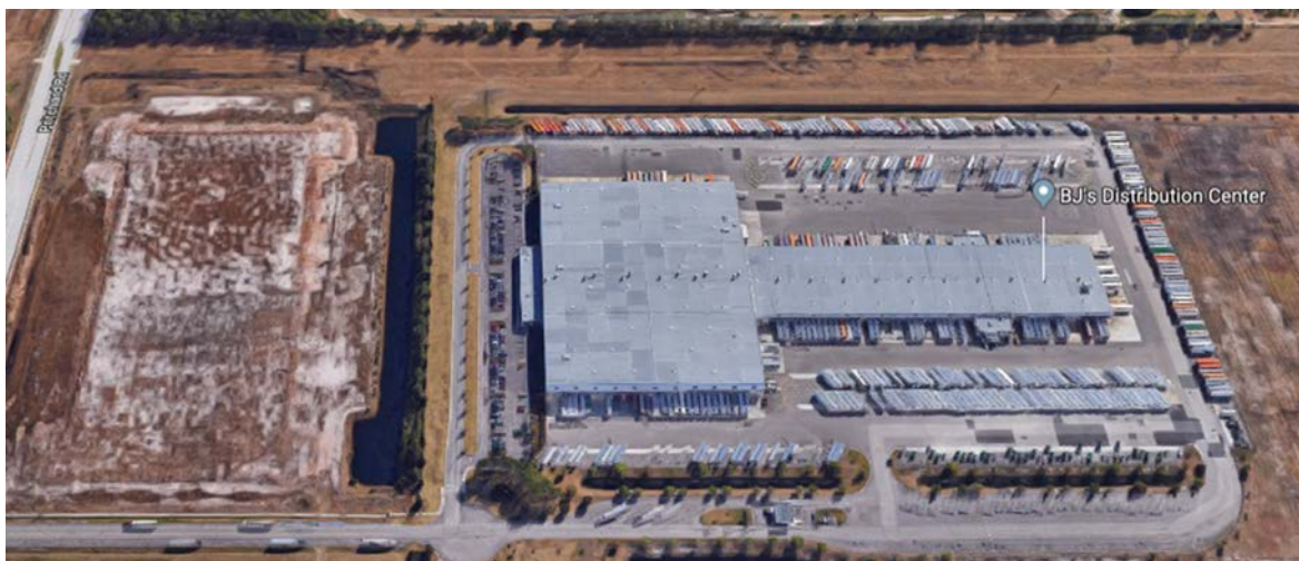
Figure CS5-1. BJ’s Wholesale Club distribution center, 4500 Director Road, Jacksonville, Florida

BJ’s Wholesale Club was founded in New England and followed its snow-bird customers to Florida. There are now 31 Clubs in Florida and five in Georgia. More are expected. The Jacksonville facility is usually called a distribution center, but it is arguably much more a cross-dock. Facing north is a 290,000-square-foot rectangular warehouse, and extending south is a long, thin 170,000-square-foot cross-dock (see Figure CS5-1). On one side, inbound product arrives from multiple vendors. On the other side, vans are allocated multiple products for specific retail locations. Like the waist of an hourglass? This is a configuration that not only facilitates high volumes, it practically enforces high velocity.