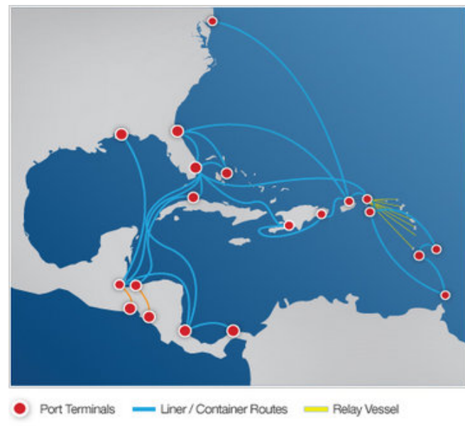
Figure CS5-5. Crowley maritime shipping lanes

Thousands of cargo containers bearing millions of emergency meals and other relief supplies have been piling up on San Juan's docks since Saturday. The mountains of material may not reach Hurricane Maria survivors for days. Distributors for big-box companies and smaller retailers are unloading 4,000 20-foot containers full of necessities like food, water, and soap this