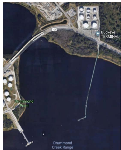
Figure CS5-3. Buckeye Terminal faces flooding on Drummond Creek

The Buckeye racks had emergency generators. The electrical outage did close several retail fuel stations. On Monday September 11, flooding was even more a problem. According to Weather Underground: “Waters along the St. Johns River in Jacksonville spiked dramatically on Monday morning, due in part to runoff from torrential overnight rains of 5”-15” across northeast Florida. At 1:06 p.m., the gauge at downtown Jacksonville’s Main Street Bridge showed a water height of 5.57’, smashing the previous modern-day record of 4.12’ observed during Hurricane Dora on Sept. 10, 1964.” [22] The Buckeye racks were 11’ above flood stage. But most tanker trucks stayed parked. Joe says: