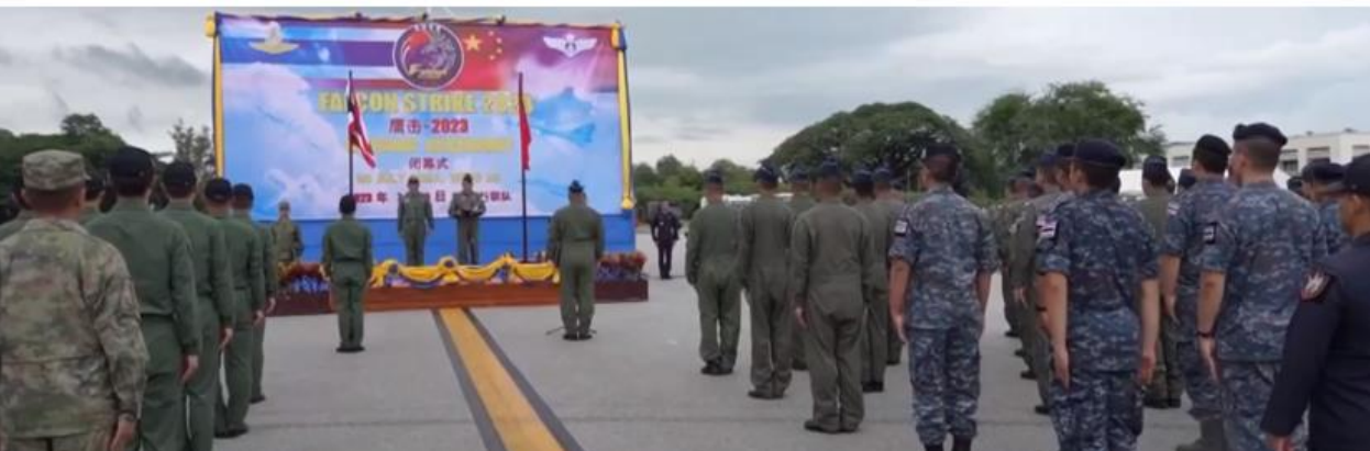
Top left: PLAAF jet fighter pilot flies over Thai airspace during Falcon Strike 2023. Top middle and right: PLAAF paratroopers practice skydiving over Thai airfield. Bottom: Closing ceremony of Falcon Strike 2023.