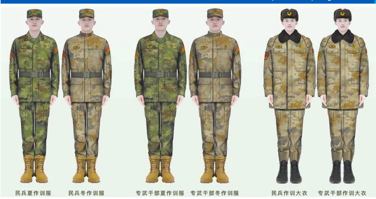
Type-21 uniforms, from left to right: militia (summer), militia (winter), PAFD cadre (summer), PAFD cadre (winter), militia (coat), and PAFD cadre (coat).

Source: PRC Ministry of National Defense.