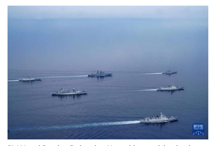
PLAN and Russian Federation Navy ships participating in Northern Interaction 2023 conduct "air–sea escort" drills.

From July 20 to 23, ships from the PLAN and Russian Federation Navy participated in the combined and joint exercise Northern Interaction 2023 (北部・联合-2023) in the Sea of Japan. The exercise, organized by the PLA's Northern Theater Command, incorporated over 10 ships and more than 30 aircraft from the naval and air forces of China and Russia. According to a report from Xinhua, the PRC government's official news agency, the exercise included subjects such as "air-sea escort, deterrence and expulsion, and anchorage defense." 11