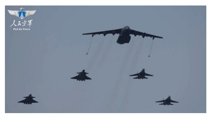
PLAAF YY-20 demonstrates ability to simultaneously refuel J-20 (left) and J-16 (right).

A highlight of the 2023 airshow was the first public display of a PLAAF YY-20 aerial tanker simultaneously <u>refueling</u> a J-20 stealth fighter and a J-16 multi-role fighter. A YY-20 pilot