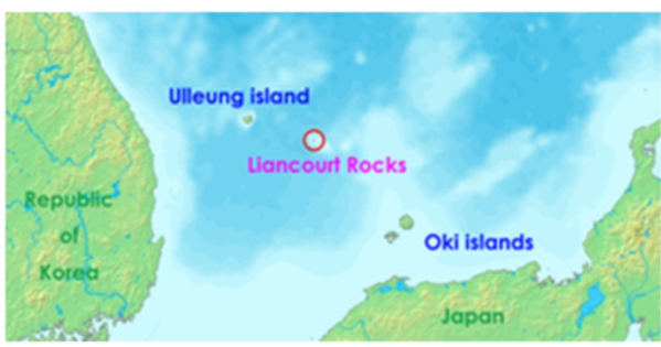
Figure 2. Location of the Liancourt Rocks 16,17

The Liancourt Rocks, also known as Dokdo or Tokto in Korean, and Takeshima in Japanese, are a group of small islets in the Sea of Japan (see figure 2 below), and are considered by both countries to be part of their respective territories. The dispute over these islets has been an ongoing spoiler in bilateral relations—surrounding waters have economic potential, but more significantly they have become a national symbol for both Korea and Japan. South Korea occupied them in June 1954 and has had administrative control of them ever since, although Japan refuses to recognize it.