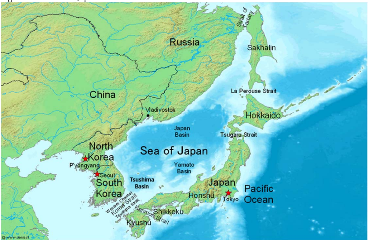
Figure 1. The Sea of Japan and its five straits

Like the Mediterranean Sea, the SOJ has almost no tides, due to its nearly complete enclosure from the Pacific Ocean. The SOJ has a surface area of some 377,600 square miles and is very deep, especially when compared to the nearby Yellow and East China seas. The mean depth is 5,700 feet (950 fathoms) and the maximum depth is slightly over 12,000 feet (2,000 fathoms)—which, among other things, means that it is excellent for submarine operations.