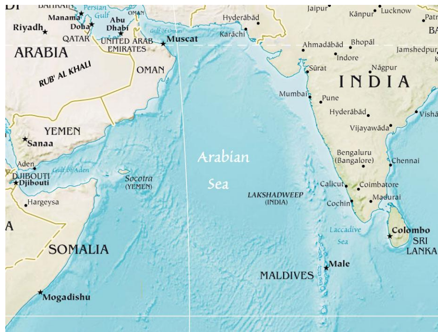
Figure 1. The Arabian Sea