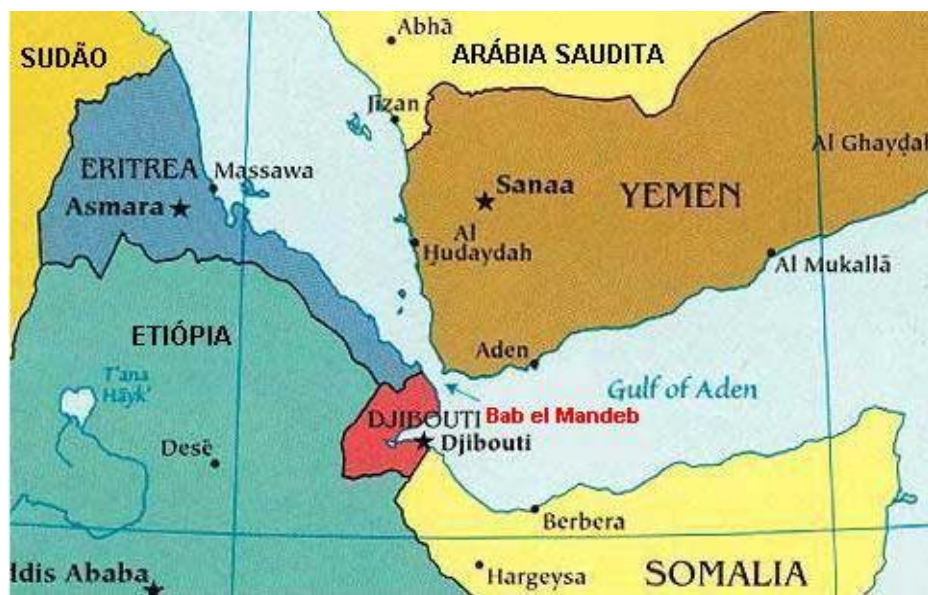
Figure 3. Bab el Mandeb 5

Thus, perhaps 7 million bbl/d of Persian Gulf oil would be available to the world if Hormuz were closed. That would leave a global shortfall of about ten million bbl/d. What makes this potential economic impact more credible is the fact that Hormuz is also the world's most threatened chokepoint. The other key global chokepoints—Bab el-Mandeb, Suez, Malacca, the Bosphorus, and the Panama Canal—are surrounded by relatively stable governments, and alternative shipping routes are available if for some reason they are closed. Only Hormuz is held hostage by both geography and a regime increasingly at odds with much of the world.