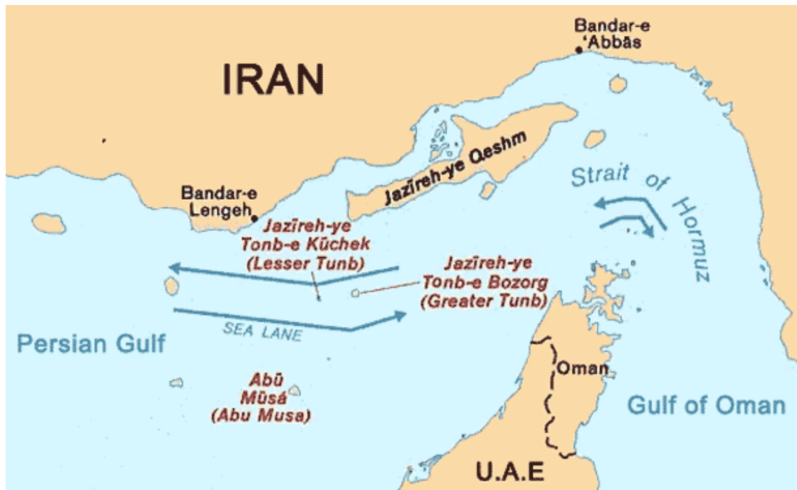
Figure 2. Strait of Hormuz 3

Some 33,000 ships transit Hormuz every year, an average of 90 ships every day, or about 4 an hour. Not all of these are tankers—on average only 28 tankers (14 outbound and 14 in-bound) transit each day. But the outbound tankers ships carry about 35 percent of the total amount of oil that travels by ship. Increasingly, these are big tankers. The strait is wide enough and deep enough to accommodate the world’s largest tankers and over 66 percent of the vessels that transit it are over 150,000 deadweight tons (dwt). Most (85%) of this oil is destined for Asia, with India, Japan, South Korea and China being the major recipients. It is difficult to imagine how the world’s energy consumers would compensate if Hormuz were closed for any time, because there are no alternative maritime exits and pipelines from the Gulf don’t have the capacity to compensate.