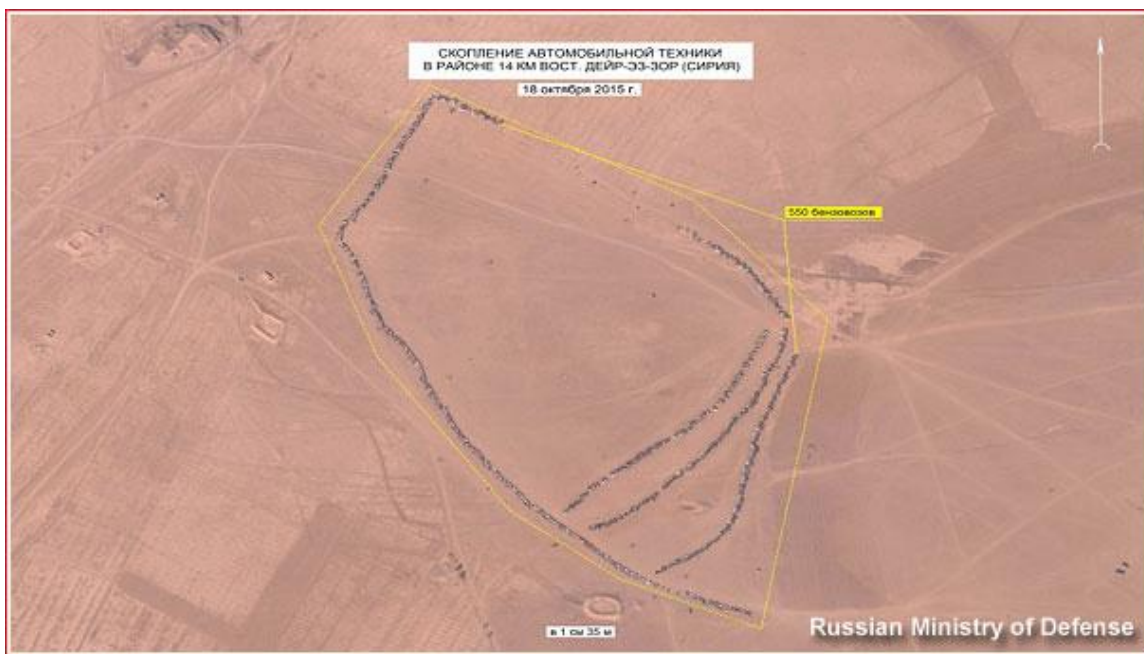
Figure 3. Aerial and satellite imagery showing Turkish government in illicit oil trade

Aerial and satellite imagery, released Dec. 3, 2015, by the Russian Ministry of Defense, to prove involvement of Turkish government in illicit oil trade with Islamic terrorist groups in Syria and Iraq