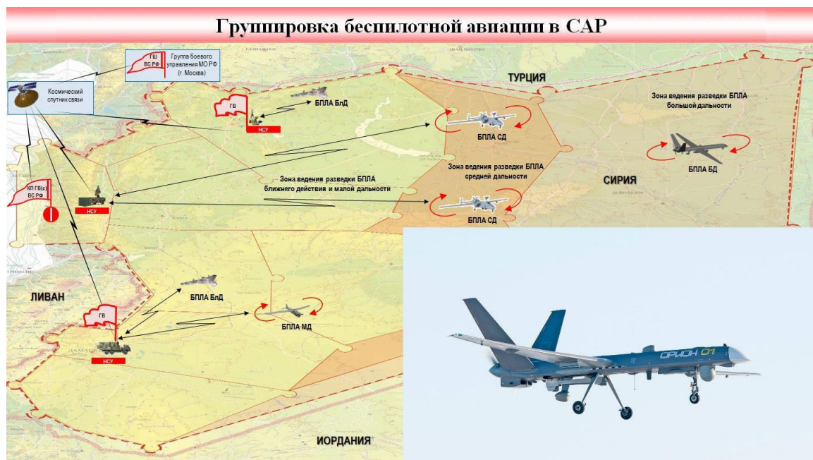
Figure 4. Russian satellites link Control Group of Chief of Staff with Russian Army units and forward mobile ground stations in Syria responsible for field deployment of UAVs

a graphic released by the Russian military, showing unidentified satellites appearing to link Control Group of Chief of Staff with main command post of Russian Army in Syria and forward mobile ground stations responsible for field deployment of UAVs.