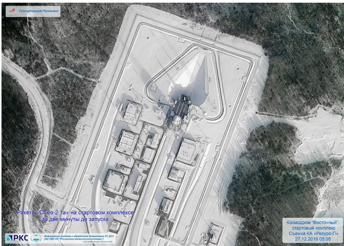
Figure 1. Photo from the Resurs-P satellite

a photo from the Resurs-P satellite shows the Soyuz-2-1a rocket with Kanopus-V5 and -V6 satellites shortly before liftoff from the Vostochny spaceport on Dec. 27, 2018.