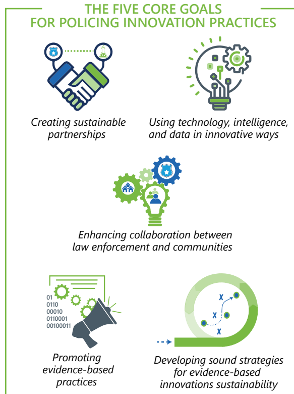
Figure 1. Core Goals for SPI