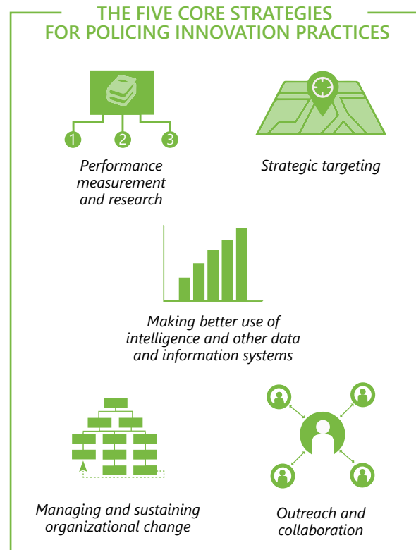
Figure 2. Core Strategies for SPI