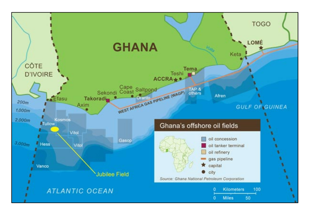
Figure 1. Ghana's offshore oil fields

runs from Lagos, Nigeria, to Takoradi, Ghana; the WAGP Extension, which runs from Takoradi to Abidjan, Côte d'Ivoire; a commercial port at Tema; and another commercial port under construction at Sekondi-Takoradi.