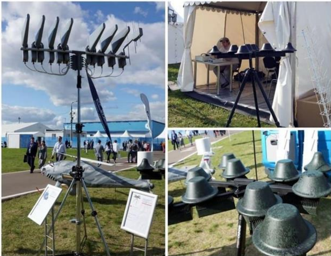
Various Avtomatika systems on display at Army-2020, https://www.aviaport.ru/digest/2020/08/25/650725.html .

Source: “Rostec presented C-UAS system with AI,” RIA Novosti, Aug. 24, 2020, https://ria.ru/20200824/armiya-1576259567.html , https://www.aviaport.ru/digest/2020/08/25/650725.html ; https://rostec.ru/news/razrabotka-kontserna-avtomatika-priznana-luchshey-sredi-innovatsionnykh-na-forume-armiya/ .