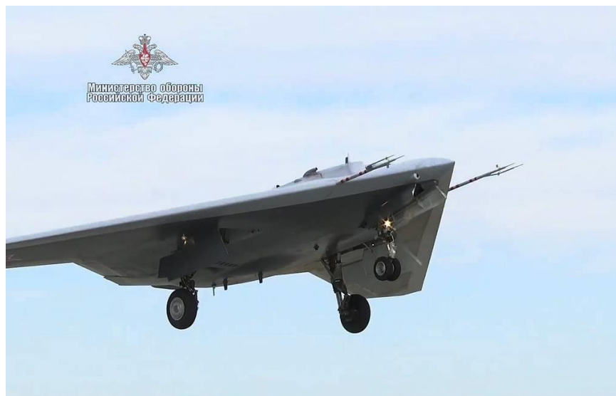
MOD image of Okhotnik in flight, https://tass.ru/armiya-i-opk/9299951 .

According to the TASS source, the MOD is also equipping the UCAV for a long-range interceptor role to take on adversary aircraft before they enter Russia’s airspace. The Russian MOD maintains that the Okhotnik should start entering service in 2024.