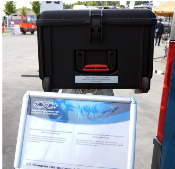
The portable Bastion-Avtomatika C-UAV system, https://www.aviaport.ru/digest/2020/08/25/650725.html .

Another system presented by Avtomatika at Army-2020 was the “Kupol” (“Dome”), which creates an electromagnetic field that the company claims is impenetrable for unmanned aerial vehicles. Once the UAV encounters it, the drone loses control and lands without incident. Kupol’s latest modernization has made the system more automated, minimizing the role of the human operator.