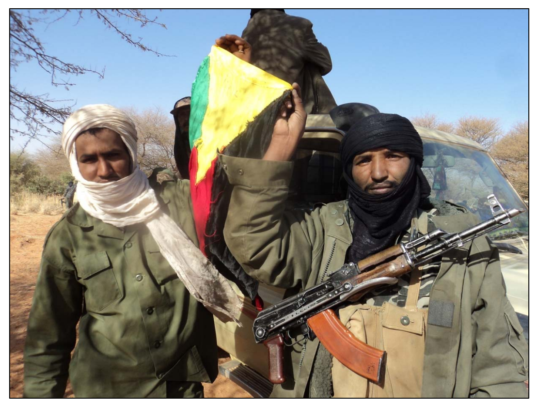
Cleared for public release