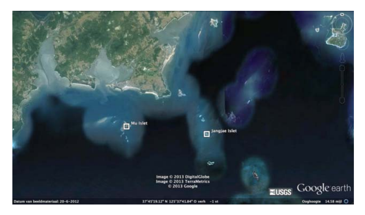
Figure 2. Jaejang and Mu Islets in the West Sea visited by Kim Jong-un in March 2013

As the crisis progressed, North Korea kept the potential of a violent provocation open but began to signal that it might conduct a non-violent demonstration instead. Pyongyang designated no-fly zones over the East and West seas and restricted ship traffic, leading some analysts to speculate that North Korea might launch Scud, Nodong, or KN-02 short-range missiles or coastal artillery. ROK sources pointed out that this training was tied to the Alliance exercises, but was much bigger than the normal exercises associated with the KPA's spring training.