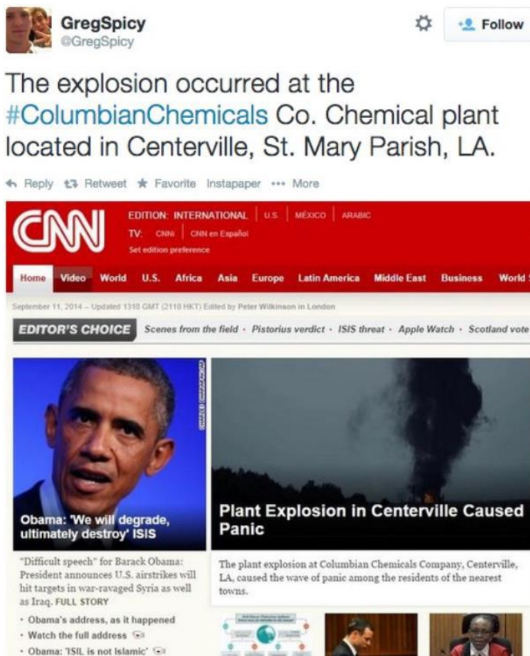
Figure 3. Twitter account posting a fake CNN homepage showing the story of the Columbian Chemicals plant explosion