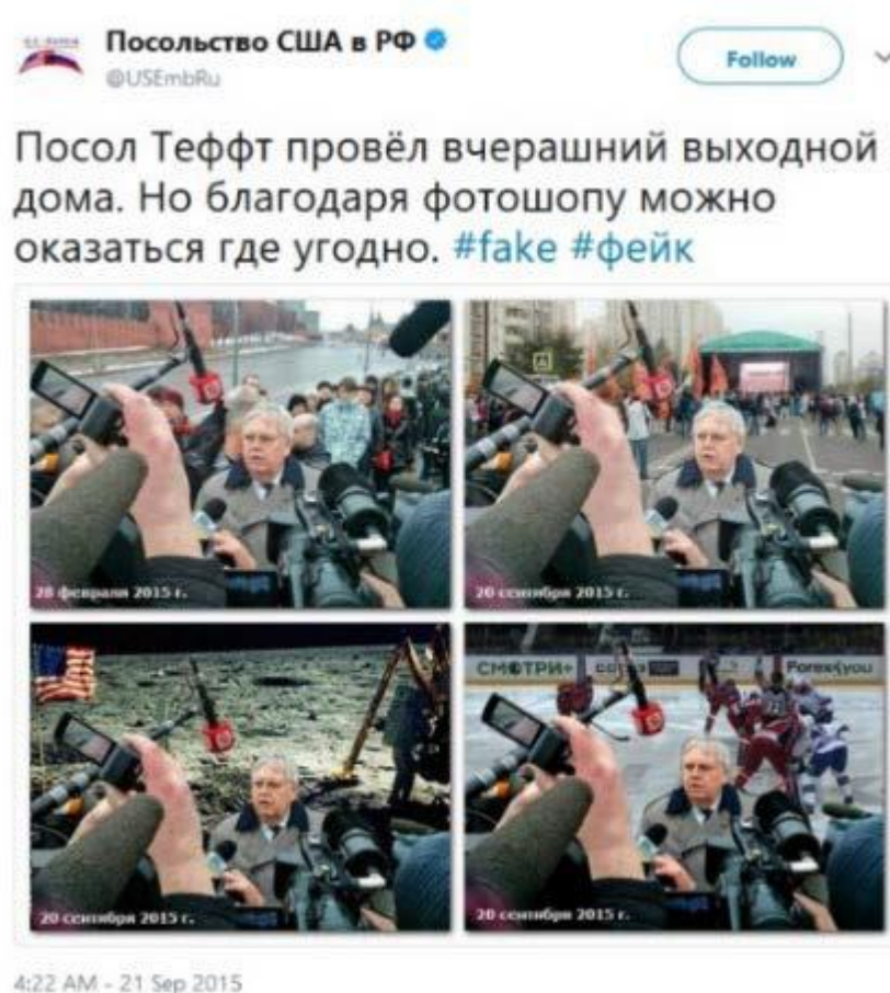
Figure 6. US Embassy response to Russian disinformation regarding US Ambassador Tefft