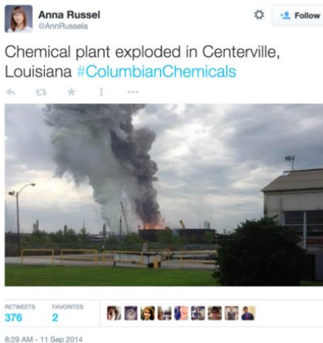
Figure 1. Twitter post showing the Columbian Chemicals plant explosion