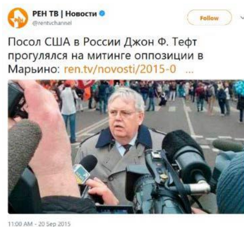
Figure 5. Russian disinformation regarding US Ambassador Tefft