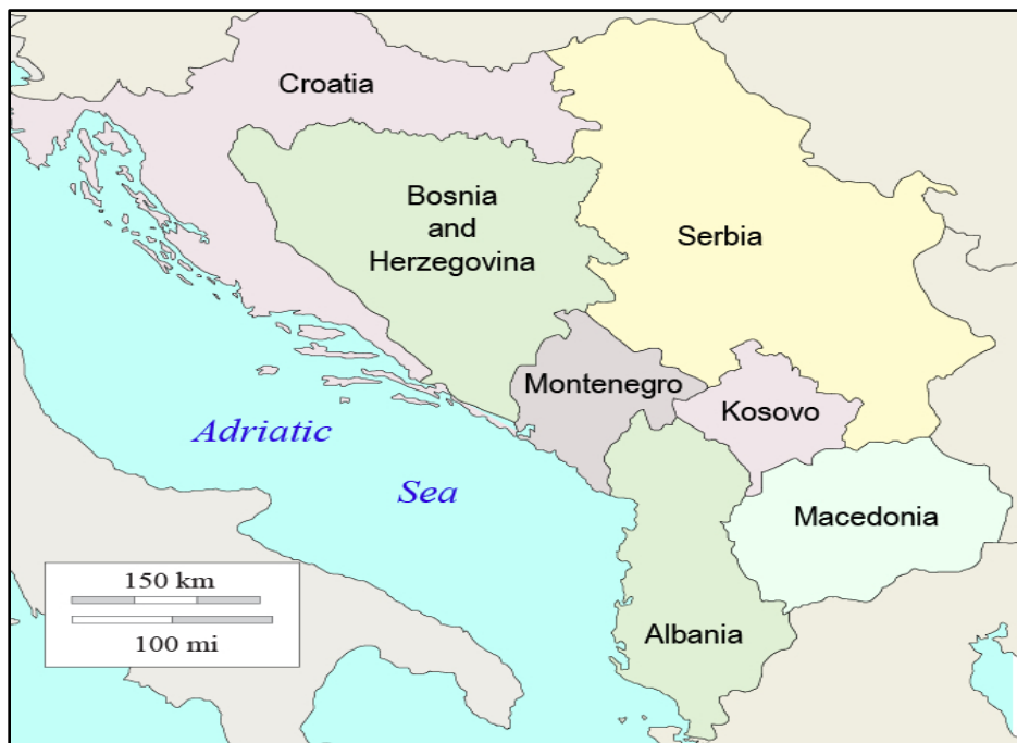
Figure 1. Western Balkans Region

In the aftermath of the violent dissolution of Yugoslavia in the early 1990s, many international observers hoped for democratic consolidation and peaceful co-existence in the Western Balkans, a region that has historically been tumultuous—standing, as it does, at the crossroads of European and Asian cultures (Figure 1). However, those postwar hopes have increasingly given way to serious concerns about democratic backsliding and internal fragmentation, with potentially catastrophic consequences for the stability of the region and the national security interests of both the United States and Europe.