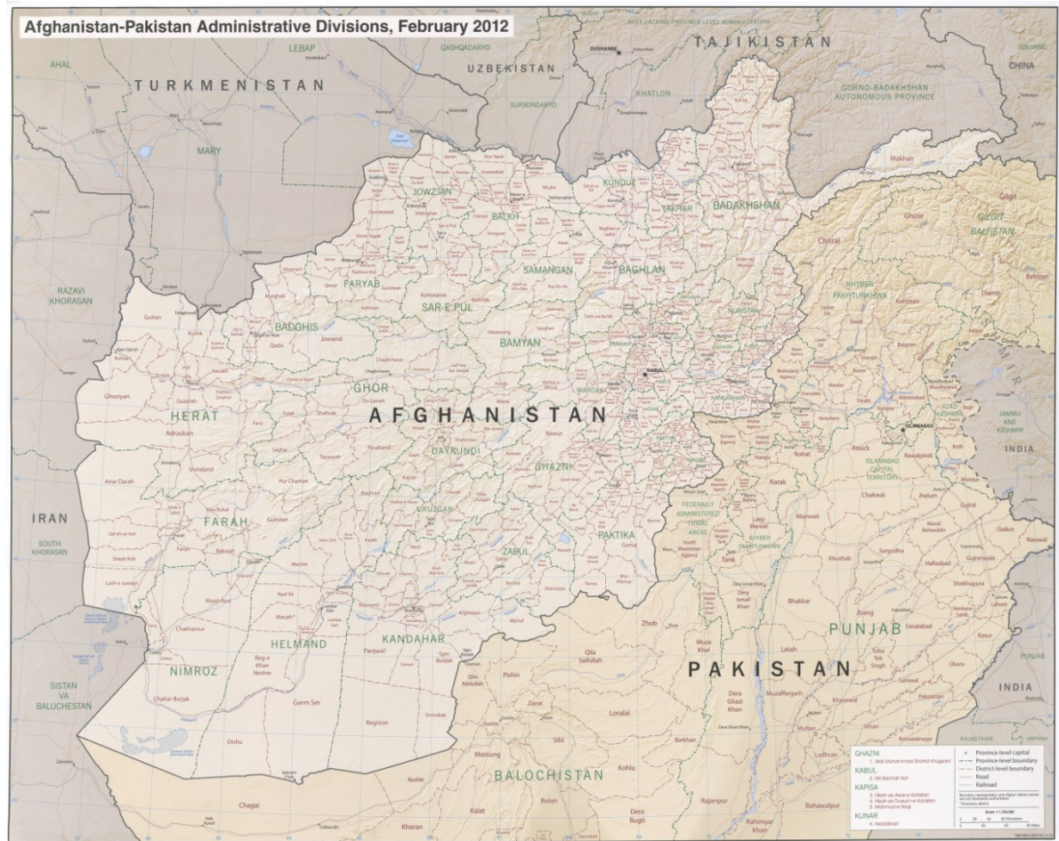
Figure 1. Afghanistan and Pakistan administrative divisions (University of Texas, available at: < www.lib.utexas.edu/maps/middle_east_and_asia >, accessed September 2013).