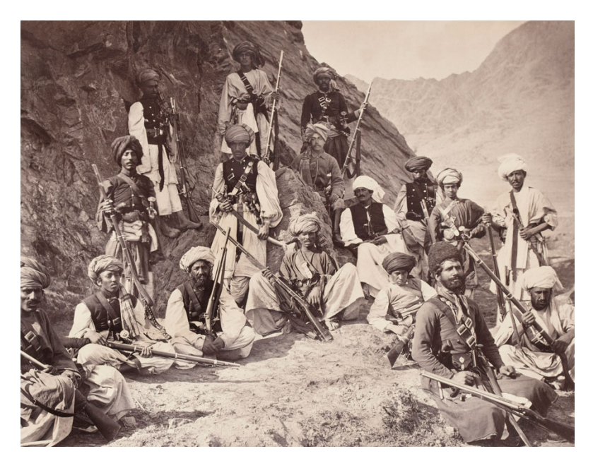
The Khan of Lalpura and followers, with British political officer, 1879.

The Frontier Corps (also known as the Frontier Scouts) traces its origins to the late nine-teenth century. Under the British imperial administration of the Indian subcontinent, a variety of lightly armed and highly mobile irregular forces, including scouts, levies, and militias, were raised to provide security along the restive Afghan frontier and within the strategically important tribal regions that functioned as a buffer between the border and India's "settled" areas. Ultimately, the Frontier Corps would have responsibility for a region stretching 2,500 miles from the Karakorum mountain range in North West Frontier Province (now Khyber Pakhtunkhwa) to the Makran coast in Balochistan.