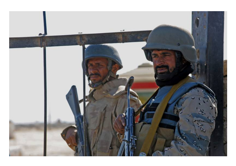
Member of the Pakistan Frontier Corps (left) and Afghan border policeman near Spin Boldak, Afghanistan.

Other assessments of the Frontier Corps are more downbeat. The frontier forces are widely acknowledged to be poorly equipped, badly trained, and poorly led. Heavy losses in battle and the frequent use of force against civilian Pashtuns have badly battered morale in Frontier Corps–Khyber Pakhtunkhwa.<sup>22</sup> Whatever Pashtun normative code that accepted (or permitted) the use of violence against fellow Pashtuns during the colonial period no longer appears to hold. Divided loyalties, or simply the fear of retribution by their own tribes, have reportedly made some FC members unwilling to carry out operations against Islamist groups.<sup>23</sup> Desertion is a serious problem, according to a 2008 report, which concluded that roughly 2,000 FC members had run away in recent years.<sup>24</sup>