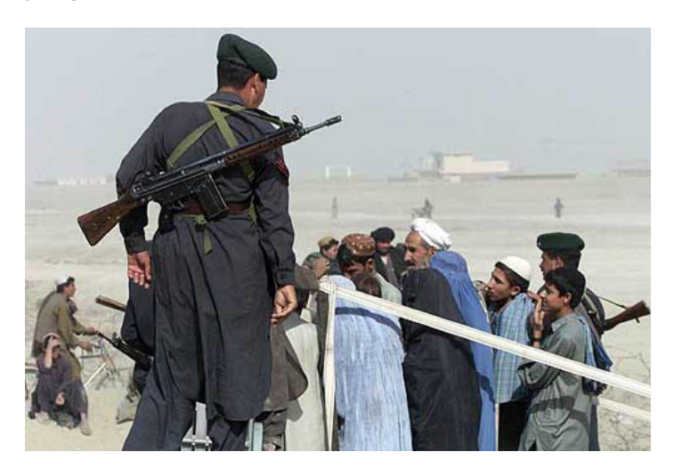
The Frontier Corps in Balochistan

A minimum of five 80-man "wings" are deployed in each tribal agency. As in the period before independence, enlisted men are Pashtun recruits and officers are drawn from the Punjabi-dominated regular army. Along the border and in the FATA, enlisted men are locally recruited, while in Frontier Corps-Balochistan, most enlisted men are Pashthuns from outside the region. Although the FC is technically a part of the ministry of the interior, it is commanded by an "inspector general," a post that since 1950 has been occupied by an army brigadier or major general. Description