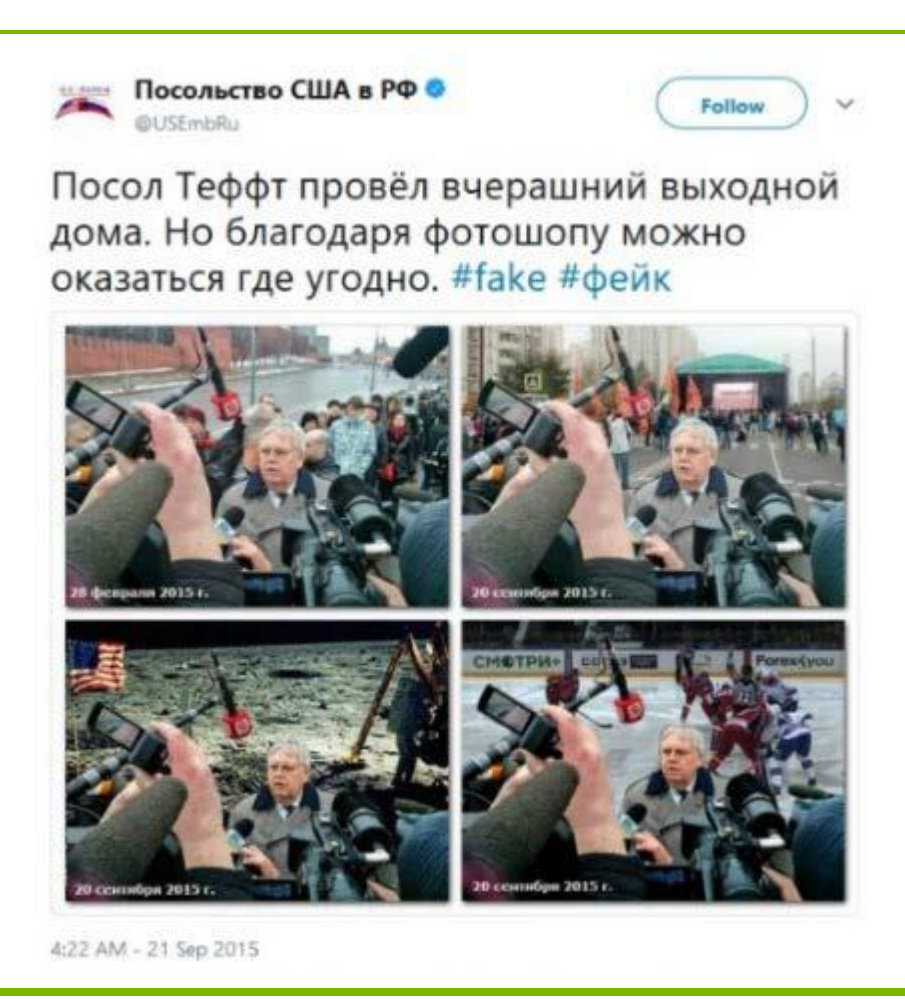
Figure 6. US Embassy response to Russian disinformation regarding US Ambassador Tefft

Source: "The American Ambassador to Russia John F. Tefft Walked at an Opposition Rally in Maryino," Посол США в России Джон Ф. Тефт прогулялся на митинге оппозиции в Марьино, Twitter, Sept. 20, 2015, https://twitter.com/rentvchannel/status/645658877426593792.