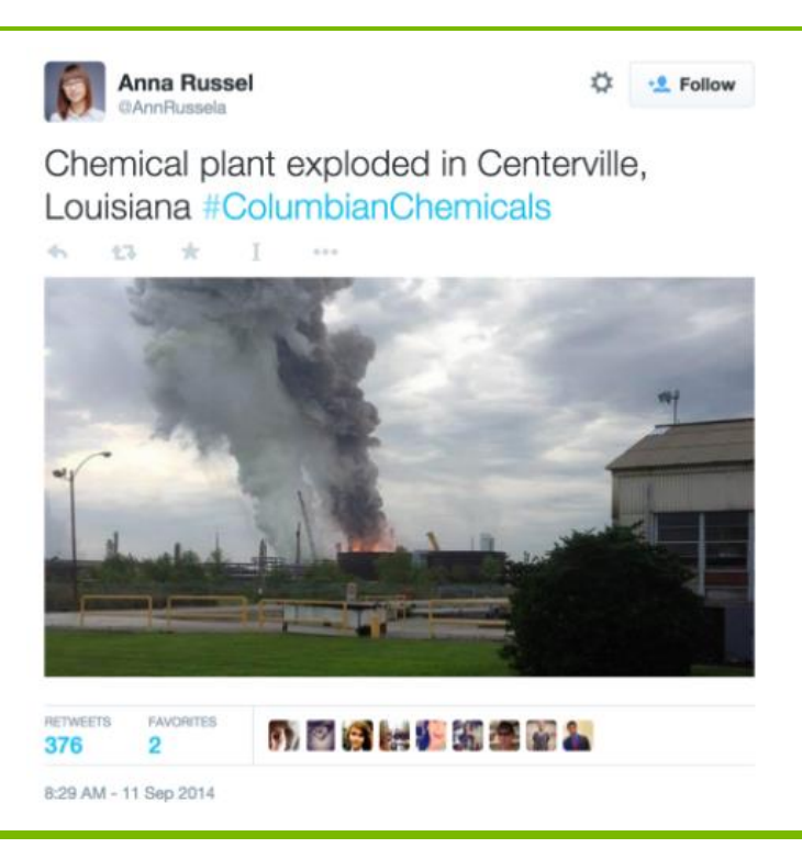
Twitter post showing the Columbian Chemicals plant explosion Figure 1.