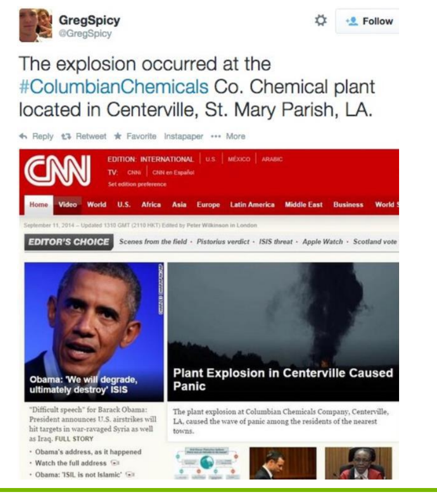
Twitter account posting a fake CNN homepage showing the story of the Columbian Chemicals plant explosion