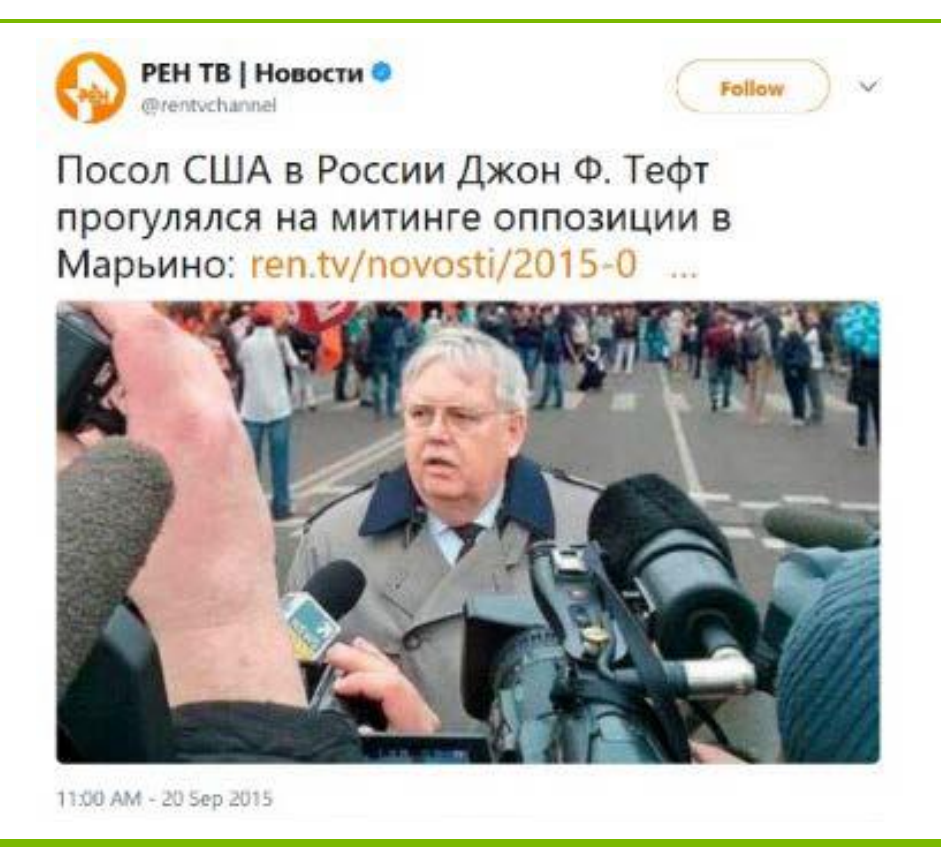
Figure 5. Russian disinformation regarding US Ambassador Tefft