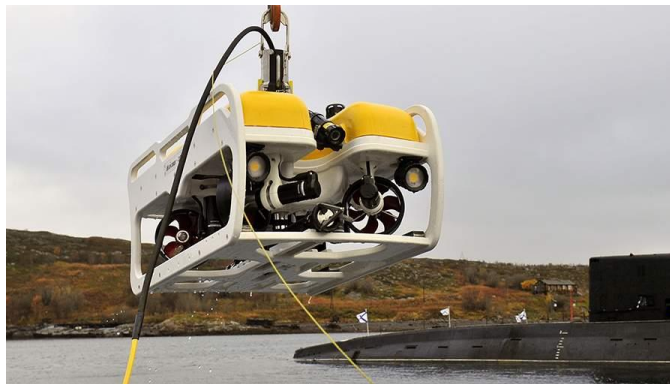
Figure 3. Marlin-350 UUV