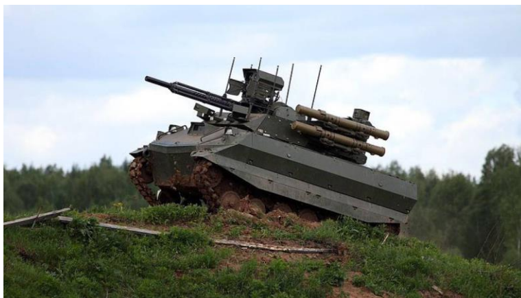
Figure 2. Recent Russian combat UGV