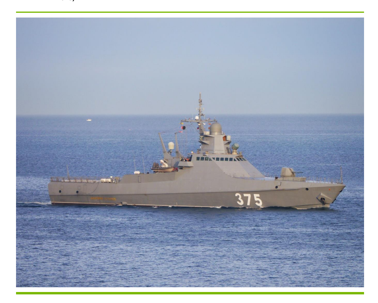
The Project 22160 patrol boat Dmitry Rogachev approaching Sevastopol (4 December 2018)