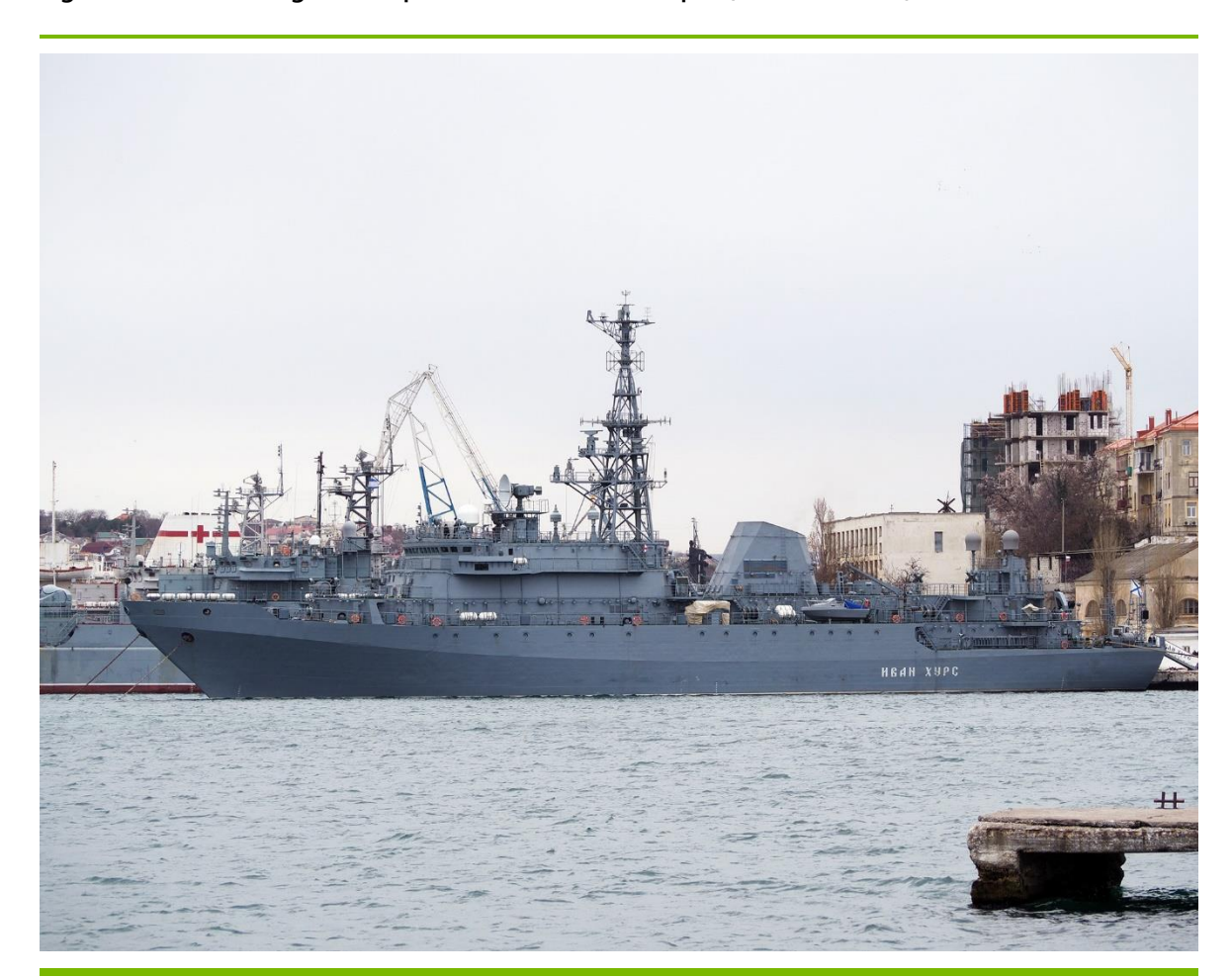
Figure 5. The intelligence ship Ivan Khurs in Sevastopol (12 March 2019)