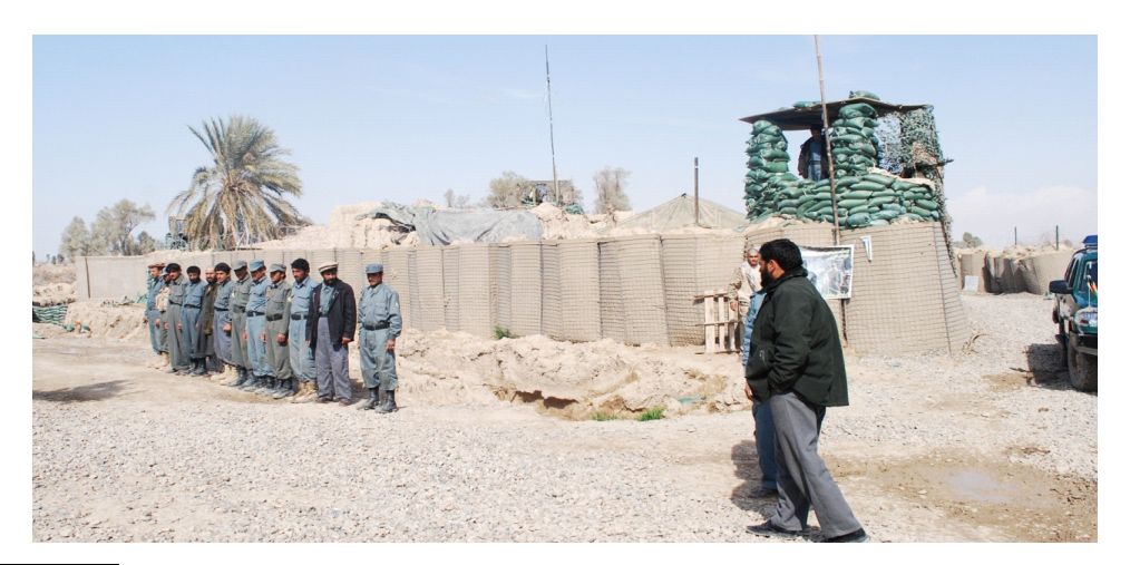
Figure 4. Omar Jan, Garm Ser district police chief, inspecting a patrol base with police and arbakai guards in March 2011<sup>a</sup>

One way to get the benefits of local and non-local police is to have locally recruited police patrolmen serving under officers from other areas (figure 4). If these officers are willing to engage with the local leaders and the public, they may be able to make objective decisions while also understanding local issues.