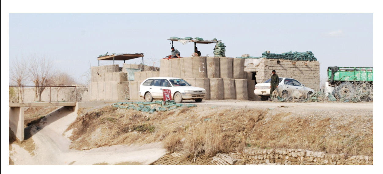
Figure 2. Police checkpoint along a main road through Garm Ser district, February 2011<sup>a</sup>

River Valley and in much of northern Helmand. As shown in figure 2, however, these "checkpoints" are nothing like the temporary sobriety checkpoints police set up in America. Instead, police mentors interviewed for this study used the terms "patrol bases" and "checkpoints" interchangeably to mean fixed positions with permanent buildings where 10 to 20 police live and work. These positions include living quarters, an area for cooking, and a latrine, and they are called "checkpoints" because most of them are located along main roads or at entrances to bazaars or schools so the police can search passing vehicles for IEDs, weapons, or drugs. As "patrol bases," these positions also provide the police with staging grounds for conducting police patrols.