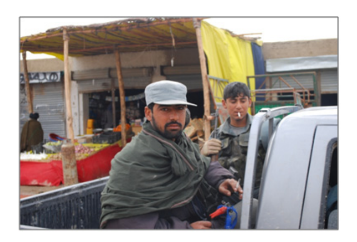
Figure 1. Police in Garm Ser district bazaar, February 2011<sup>a</sup>