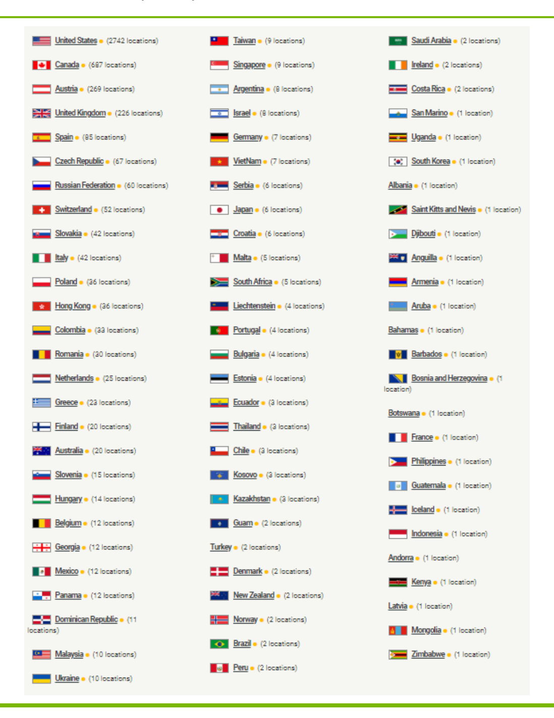
Figure 3. Bitcoin ATMs by country