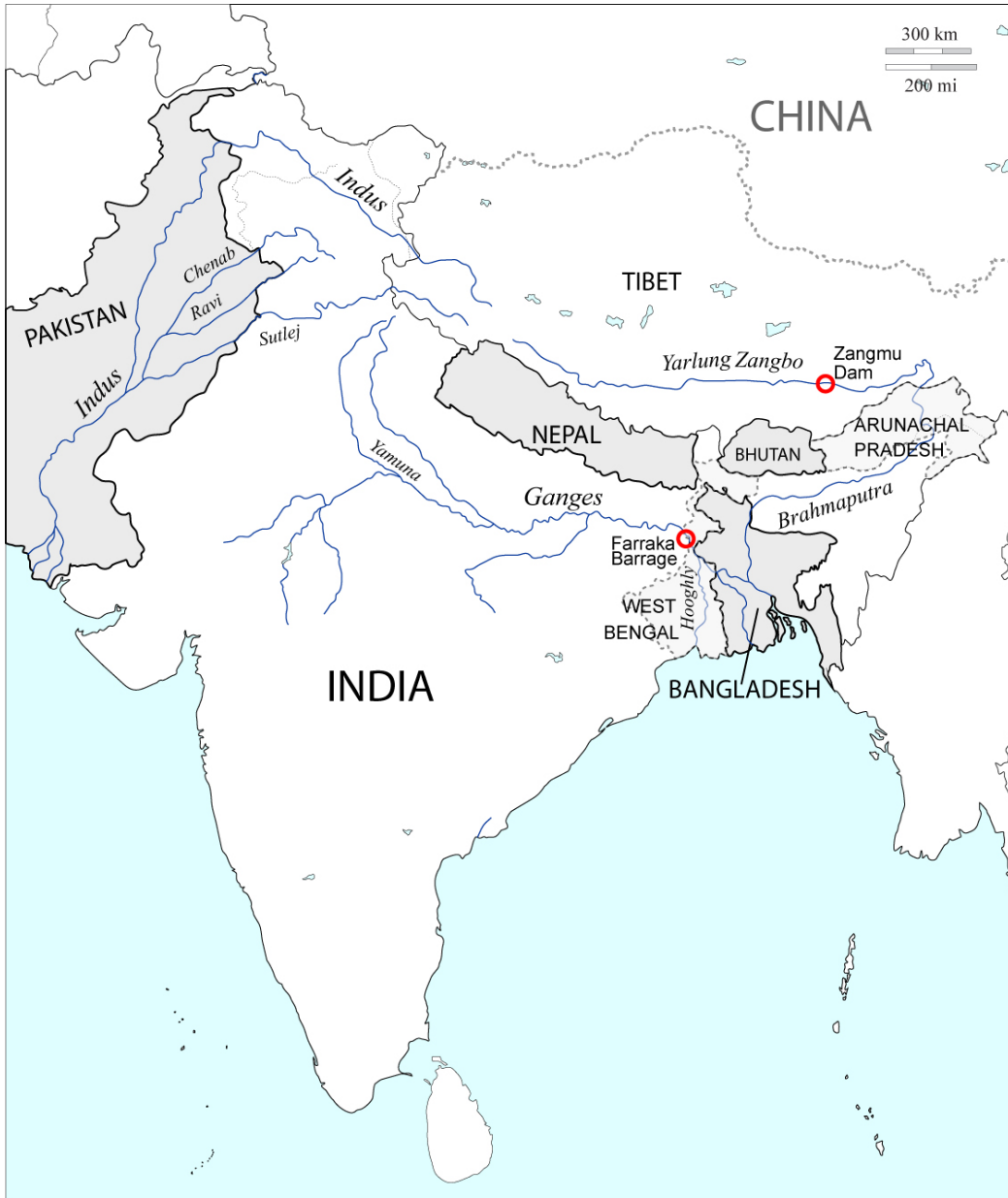
Figure 1. Map of region a