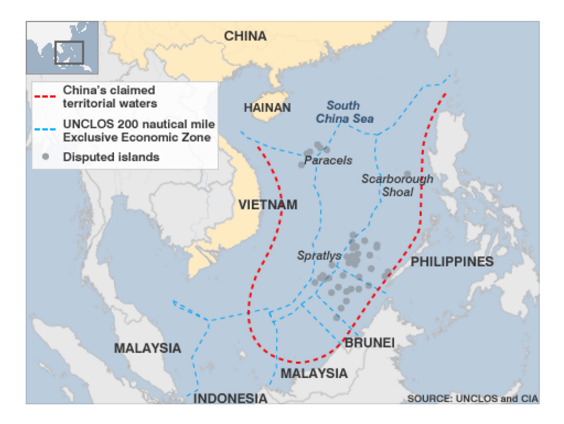
Figure 1: South China Sea maritime disputes

Workshop Two: Naval Developments in Asia